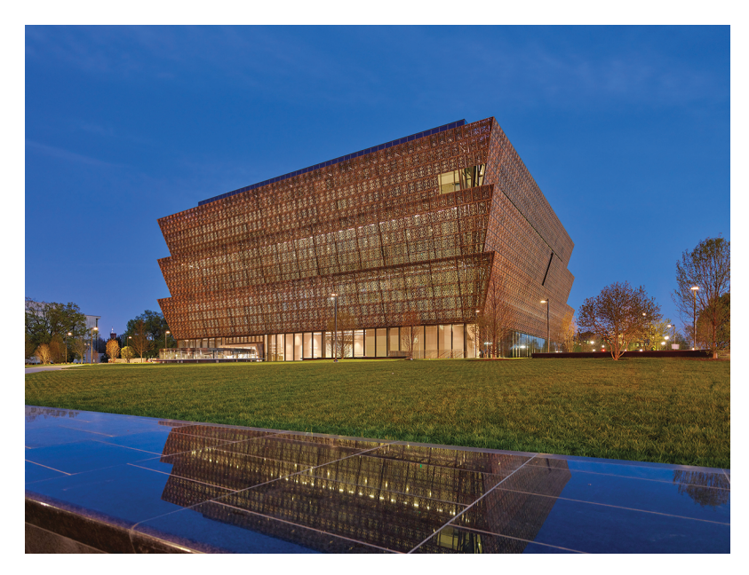
Figure 2: The three-tiered corona was inspired by West African Yoruba culture and art, the bronze-colored aluminum panels were modeled on ornamental ironwork made by slaves in Louisiana und South Carolina, and the main entrance serves as a reminder of porches used throughout the African diaspora.

In his book Bunch book describes in detail and in an entertaining and revelatory way that does not gloss over mistakes and failures the long process of deciding on a site, picking the architectural firm and the designers, the team of researchers and curators, the many meetings with politicians and possible donors, conflicts inside the Smithsonian, building up a collection, deciding on what to include in the exhibits and on the story lines, etc.