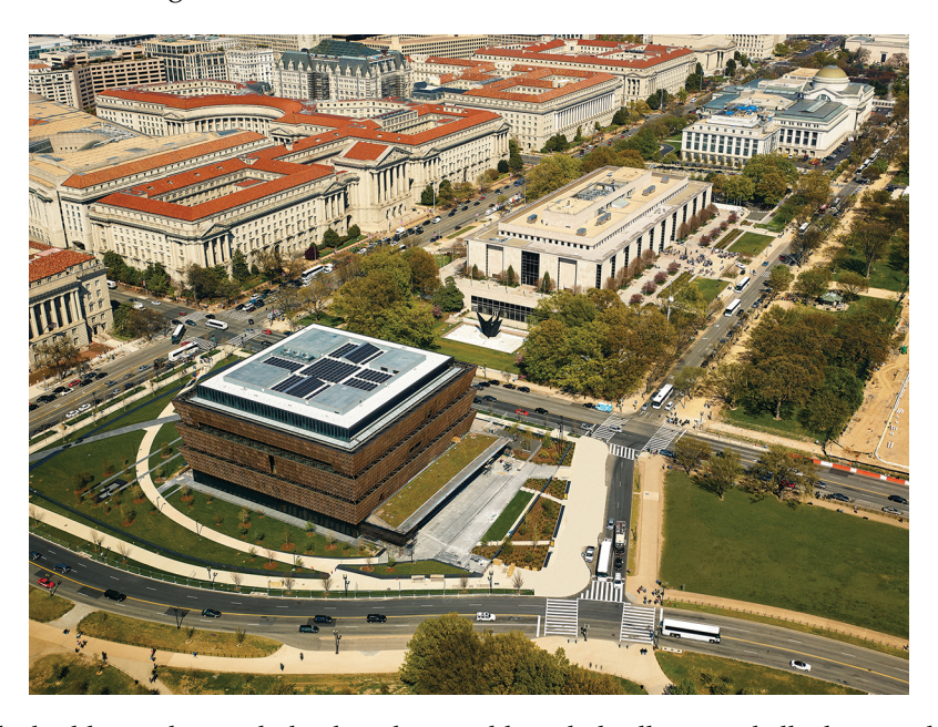
Figure 1: "I needed the building to have a darker hue that would symbolically remind all who visit the Mall that there has always been a dark presence in America. A presence that was often overlooked or undervalued. This building would be a visual antidote to that historical amnesia." The National Museum of African American History and Culture, next to the Smithsonian National Museums of American History and Natural History (right).

By all measures, NMAAHC has been a spectacular success and truly "stands out" on the Mall with all its white and marble buildings and monuments. [Figure 1] What started as "a museum of no: no staff, no site, no architect, no building, no collections, and no money" (8) now boasts a magnificent building and exhibition space. Visitors – many of them young, many African American, and many first-time museum goers – have been flocking to the new museum in much higher numbers than expected. So far, over five million have come. On average they spend more than five hours looking at the 3,000 artifacts, 3,500 photographs and images as well as 160 media presentations. <sup>1</sup> [Figure 2]