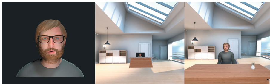
Fig. 2 The software used for delivering the VR part of the therapy, developed by Khora VR, enables the person to interact with the avatar at different distances, allowing the therapist and patient to graduate the proximity to the avatar as needed

of the avatar and is provided with an audio recording of the dialogue with the avatar and is encouraged to listen to the recording at home to boost habituation to the exposure, to further enhance the patients' sense of power in the relationship and to allow them to share their experience with family, friends or their regular treatment provider.