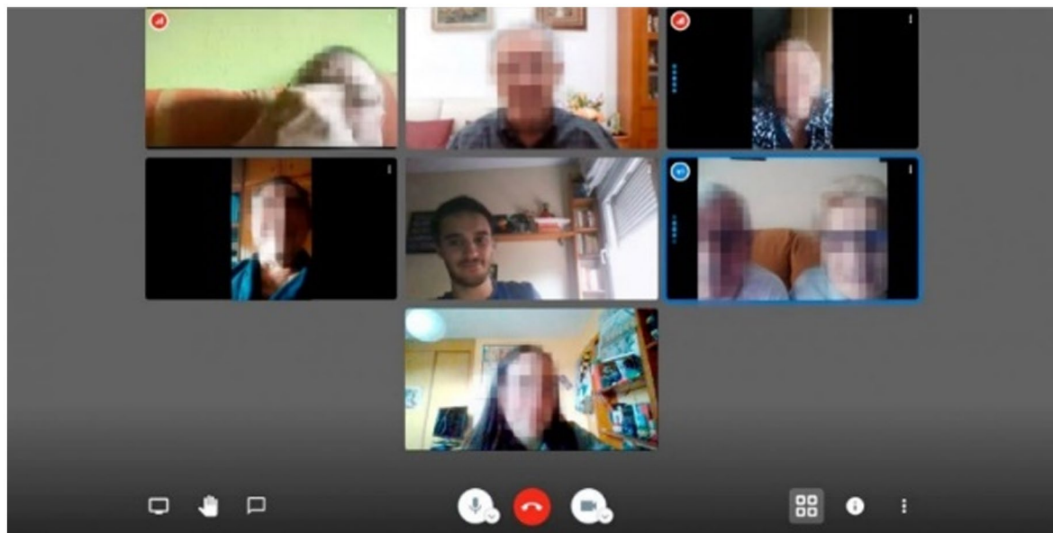
FIGURE 1 | One of the talks on Jitsi with advanced students of information and communication technology (ICT).

Jitsi posed barriers for a few students. The ethnographer shared the call’s link on WhatsApp, and since many did not