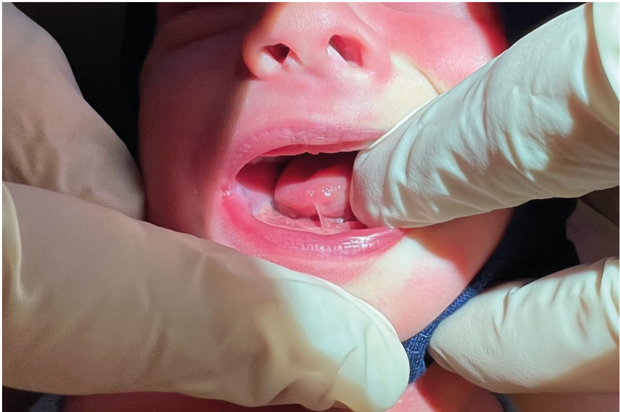
Infant boy (eight days old) with severe ankyloglossia (tongue-tie and breastfed babies assessment score = 0) undergoing lingual frenotomy.

the underlying floor of mouth fascia – which mobilises into a midline fold with tongue elevation and/or retraction [3]. A tightening of the lingual frenulum may potentially cause limited tongue movement and thereby possibly lead to breastfeeding difficulties. The condition is often labelled as ankyloglossia and is casually referred to as tongue-tie (TT). To relieve the infant and mother of the problematic consequences of TT, a frenotomy is usually performed. The procedure is accomplished by stretching the restricted frenulum by lifting of the tongue towards the palate and cutting through the white fascia-like tissue with surgical scissors.