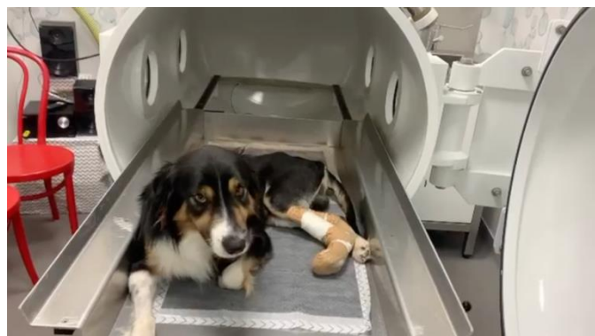
Figure 2. Dog placement inside the hyperbaric oxygen chamber.

The number of sessions was decided according to the needs of each animal, whilst respecting the checklist of minor and major side effects. A rule of at least two treatments per animal was implemented. The first session had a longer treatment phase, and the HBOT