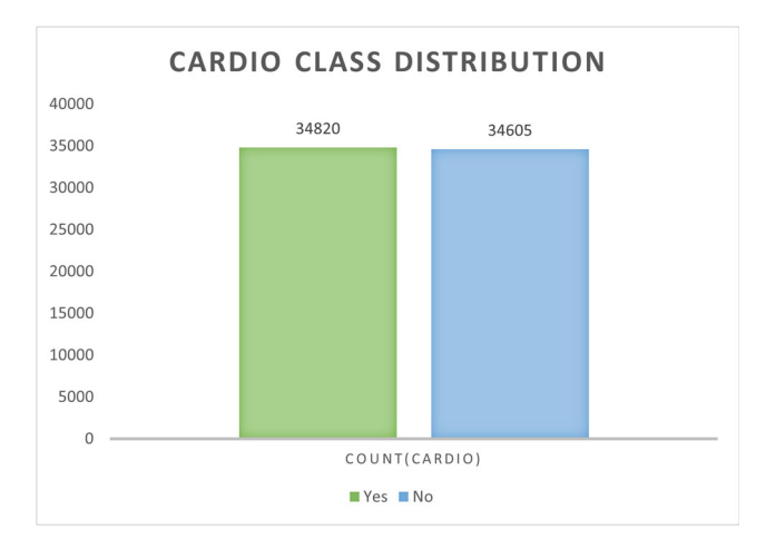
Fig. 2 Class distribution of the target variable cardio

At first, data was integrated and the data-cleaning process was applied. In more detail, it was analysed the existence of duplicated data, missing values, outliers, and