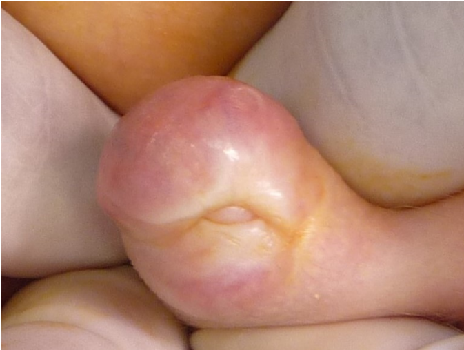
Fig 4. Hypospadias .