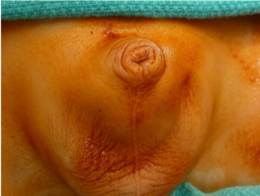
Fig 8. Ventral curvature.