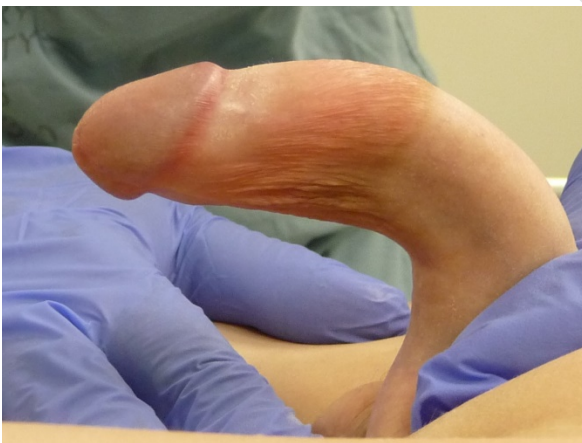
Fig 9. Megameatus intact prepuce hypospadias variant.