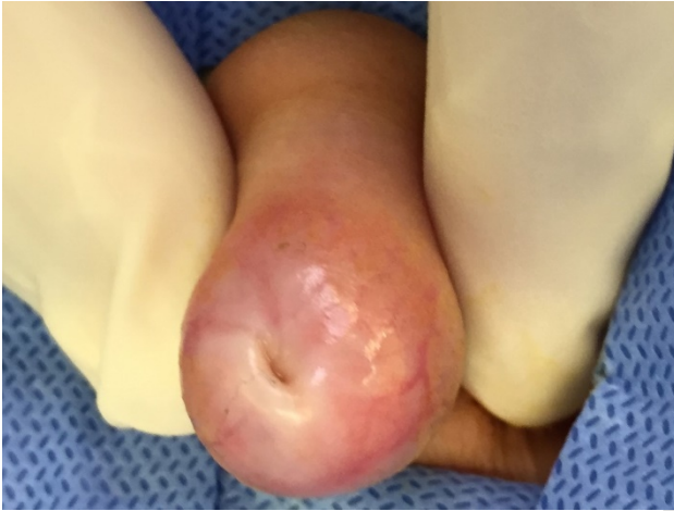
Fig 2. Balano-posthitis.