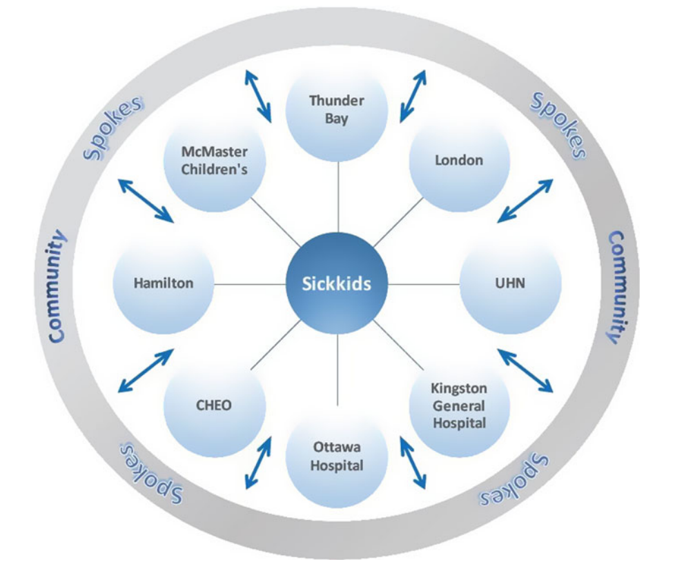
Figure 1: Project ECHO Ontario – Epilepsy across the Hub-and-Spoke Organization. Represents the hub-and-spoke model of ECHO. CHEO, Children's Hospital of Eastern Ontario.

improved access and education to facilitate gene panel testing throughout the province. At present, OOC testing is requested by geneticists, metabolic specialists, and a few neurologists in tertiary care centers. In order to inform and educate additional care providers, epilepsy genetic testing was to be incorporated into a video-conference-based extension of community healthcare outcomes ("ECHO") model<sup>11</sup> of knowledge translation for epilepsy in Ontario. Secondly, it was recognized that genes present on commercially available panels did not, necessarily, show significant scientific evidence of being clinically relevant to epilepsy. Therefore, an evidence-based approach to the gene composition of a panel, and the coverage of the genetic variation within the gene, was considered a priority. Lastly, the test was to be implemented as part of a sustainable program in order to continually evaluate and improve epilepsy testing going forward.