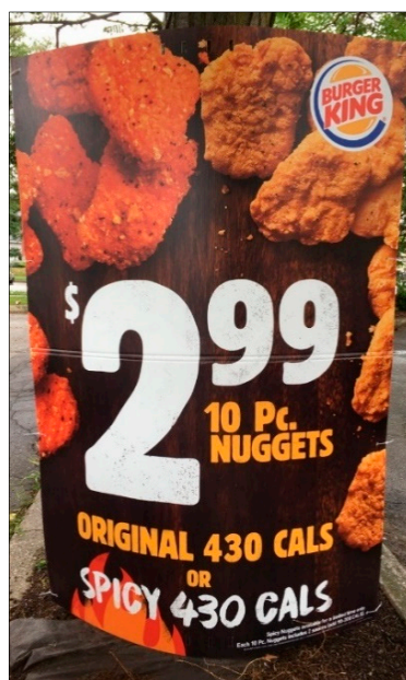
Figure 6. Advertisement C.