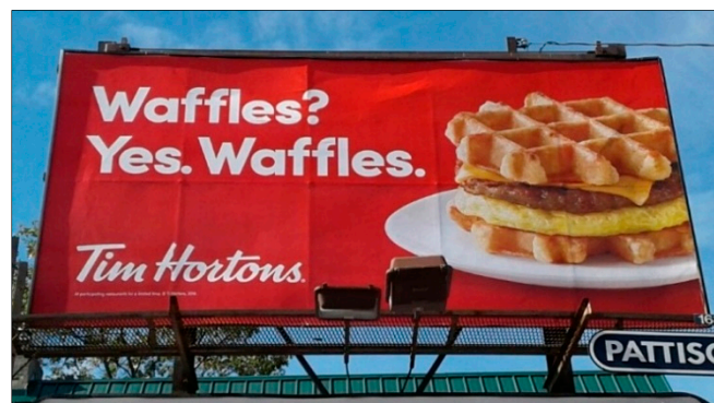
Figure 5. Advertisement B.