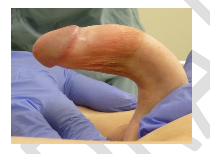
Fig 9. Megameatus intact prepuce hypospadias variant.