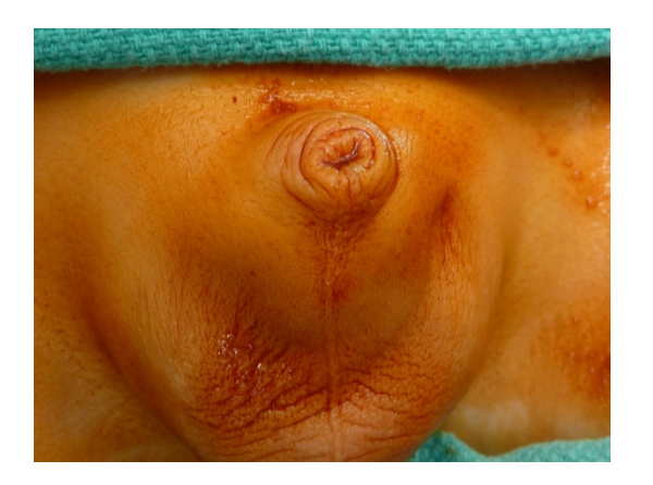
Fig 8. Ventral curvature.