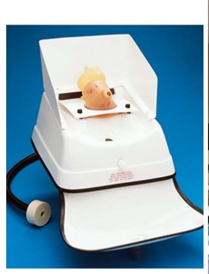
Fig. 1. Bristol transurethral resection of the prostate trainer. From manufacturer (https://limbsandthings.com/uk/). A complete training system for the transurethral resection of the prostate (TURP) using monopolar and bipolar electrosurgery. This model was developed in conjunction with the Institute of Urology, Southmead Hospital, Bristol, UK. Skills: Fluid management; insertion, manipulation, and removal of instruments; identification of anatomical landmarks and tissue types; resection techniques within lifelike spatial constraints; evacuation of chips and bladder flushing.