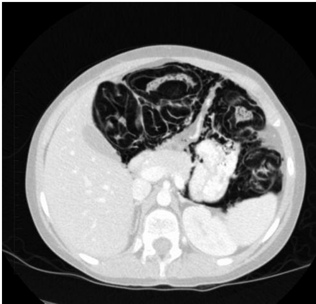
Figure 3. Infused CT scan of the abdomen, axial view, showing circumferential pneumatosis intestinalis of the transverse colon.

monly be secondary to bowel necrosis. Despite the cutaneous ulcerations in our patient, she did not have life-threatening PI. Pneumoperitoneum, as observed in our patient, can also occur in benign PI, which in this context is usually the consequence of the rupture of a subserosal cyst rather than a true perforation 10,12 . Worrisome features on imaging include signs of bowel wall inflammation or ischemia manifesting as bowel wall thickening, free fluid, or portal gas 12 , which were absent in our case.