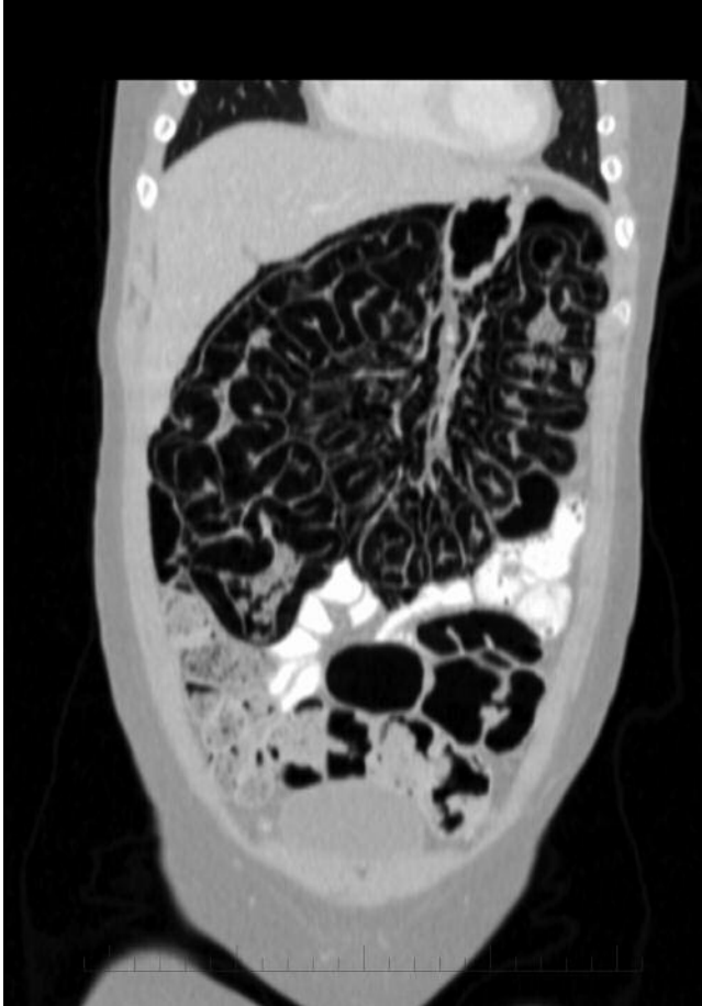
Figure 2. Infused CT scan of the abdomen, coronal view, showing extensive pneumatosis intestinalis in the large colon.