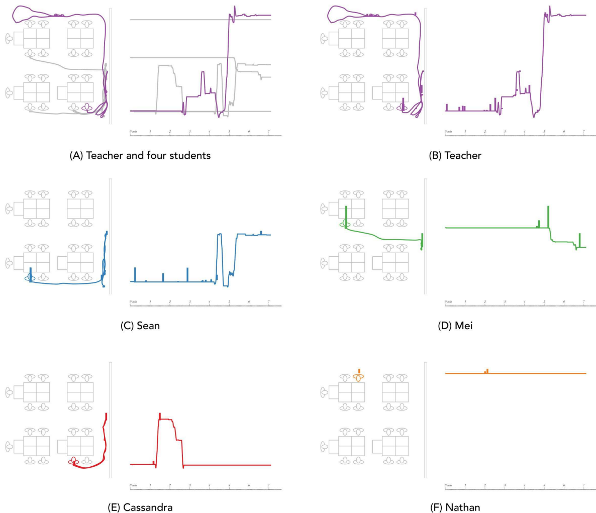
Figure 2. Teacher and student movement and conversation over space and time during a seven-minute sequence of classroom interaction: (A) Teacher (purple) and four students’ movement (gray); (B) Teacher movement and conversation, where rectangles indicate conversation turns and the height of each rectangle indicates the length (in words) of each turn; (C-F) Four individual students’ movement and conversation. (Data used with special permission from Mathematics Teaching and Learning to Teach , University of Michigan).

In comparison to existing work, Figure 2 provides a new type of view of classroom conversation unfolding over space and time. Each image provides a detailed view of an individual’s movement and conversation, while the images together provide one type of overview of classroom discourse during this sequence of interaction. These images support rapid comparative analyses between participants in this interaction. For example, the teacher made a number of conversational turns at the beginning of this interaction, but made far fewer utterances after walking across the classroom, as she handed the conversation over to Sean and Mei. Three students — Sean, Mei, and Cassandra — walked to the chalkboard at different points during this sequence of interaction, while Nathan remained at his desk as he made two brief utterances over a period of about 15 seconds. These images provide a way to quickly study and compare individual interaction patterns within a classroom context in ways that highlight particular spaces and moments of potential importance. This, in turn, highlights the need to interact with these representations to more closely study such spaces and moments.