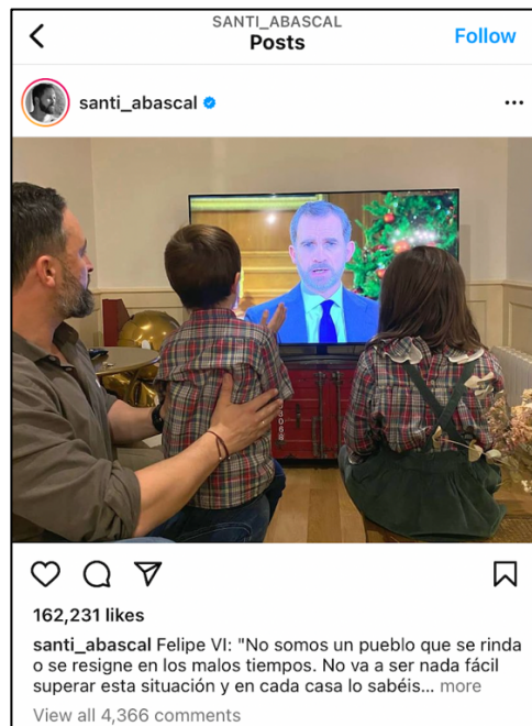
Figure 7. 'Felipe VI' 24 December 2020

recurrent and potent use of the platform, whereby followers might engage with content based on personal interests rather than the political messages embedded therein. On December 24, 2020, Absacal posted a domestic scene with his two children, as the three of them watched the annual address of King Felipe VI: