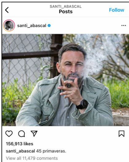
Figure 1. '45' 13 April 2021

emerges here between the private and public nature of these images. It appears as though Abascal has been caught in a moment of introspection—in Figures 2, 3, and 4 he looks off into the distance, seemingly unaware of the camera—but the captions suggest a calculated effort to represent the politician as such at