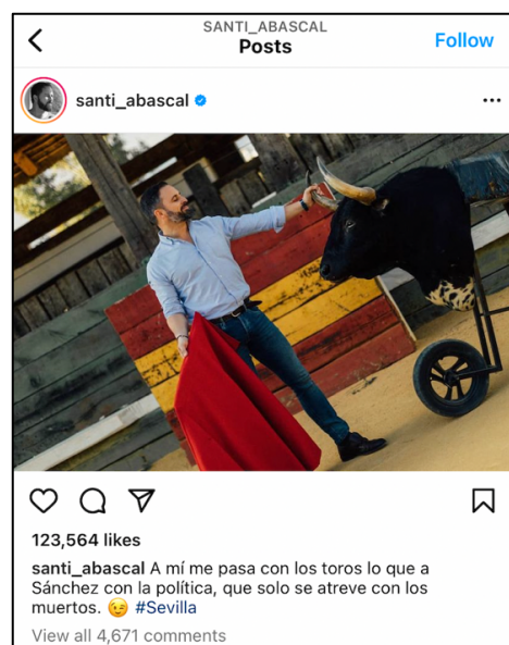
Figure 6. 'I deal with bulls' 7 November 2019

A popular post from the previous year (Figure 6) also makes use of sarcastic humor: