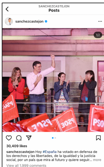
Figure 15. ‘Spain has voted’ 28 April 2019

In three posts somewhat different to those discussed, Sánchez exhibits a modicum of range within the respectable politics of traditional statesmanship. His variety of masculinity is one of confidence and decorum; he thus demonstrates none of the ‘political machismo’ that drives Abascal’s manner of doing politics (Smith & Higgins, 2020: 551). In Figures 15, 16, and 17, Sánchez reveals himself to be successful, compassionate, and responsible without ever challenging expectations of his role as national leader. Here, we see him in what seem to be candid shots, looking away from the camera as he is engaged in some activity: