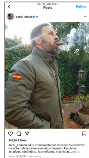
Figure 3. 'Very worried' 18 December 2020