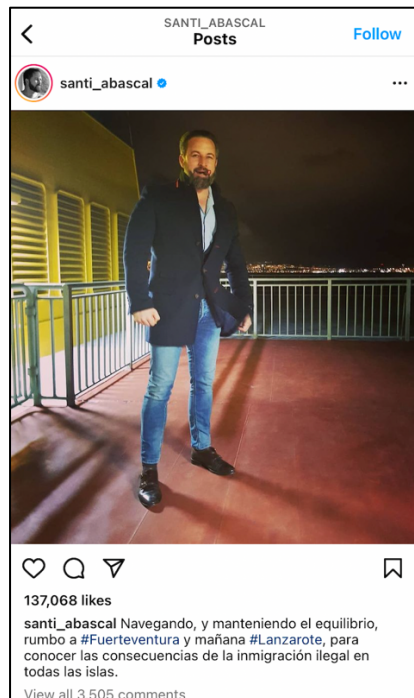
Figure 5. 'Maintaining the balance' 4 December 2020