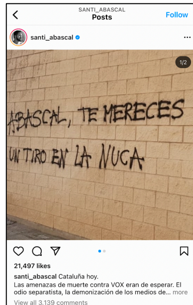
Figure 9. ‘Catalonia today’ 11 January 2019