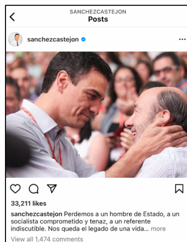
Figure 16. ‘Pérez Rubalcaba’ 10 May 2019