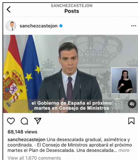
Figure 13. 'A gradual de-escalation' 25 April 2020