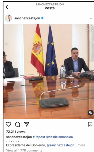
Figure 11. 'The president' 18 April 2020