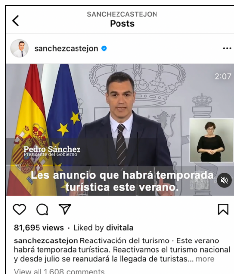
Figure 14. 'Reactivation of tourism' 23 May 2020

Still, even in posts that do not address the pandemic, Sánchez's authority derives from displays of competent masculinity that include formal clothing and erect posture, along with material signs, such as flags and logos, that all together signify his commensurability with the establishment. In many of his posts such as Figures 10, 12, 13, and 14, he looks directly at his political subjects, thereby interpellating them as equal citizens.