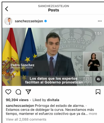
Figure 10. 'Extension' 4 April 2020