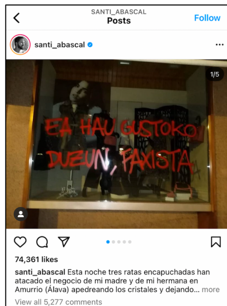
Figure 8. ‘Three hooded rats’ 7 November 2020

While Abascal’s political platform remains implicit in these photos of the plaza de toros and King Felipe, it is undeniably explicit in two posts attacking regional nationalism. Since its inception, Vox has advocated for a more centralized Spanish government by diminishing the sovereignty of the 17 Autonomous Communities that have comprised the nation since the Constitution of 1978. In these two photos, Abascal features main images with graffiti, showing himself to be the target of blatant acts of vandalism in the Basque Country (Figure 8) and Catalonia (Figure 9):