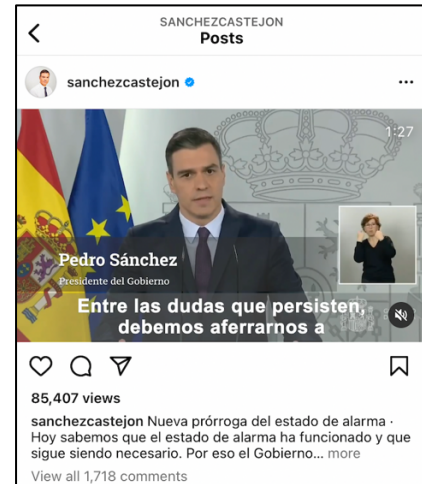
Figure 12. 'New extension' 2 May 2020