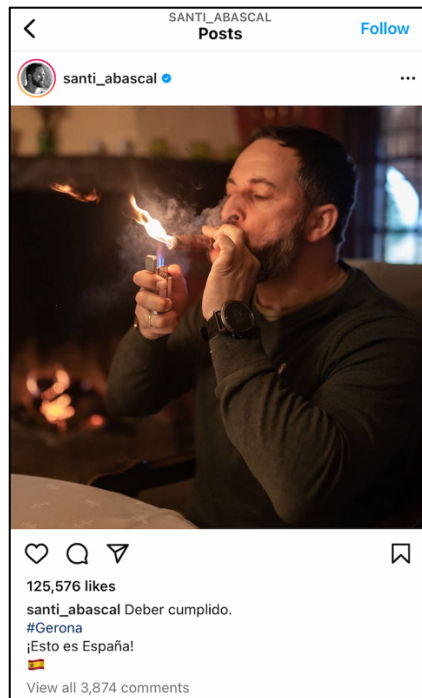
Figure 4. 'Mission accomplished' 13 February 2021