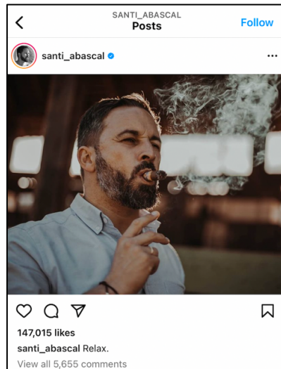
Figure 2. 'Relax' 16 November 2019