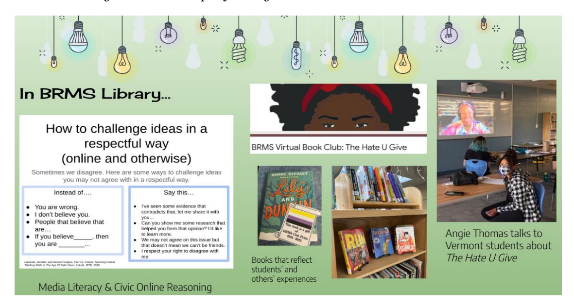
Figure 1 How to Challenge Ideas in a Respectful Way