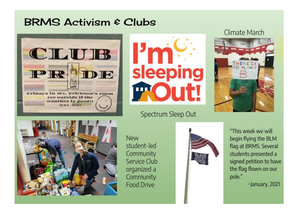
Figure 2 BRMS Activism & Clubs

March in 2019. Our school proudly flies the Black Lives Matter flag in front of our school partly because students worked to make that happen. We have a thriving PRIDE club which welcomes all students to participate. Though there is still work to be done, we have three gender-inclusive restrooms available in our school.