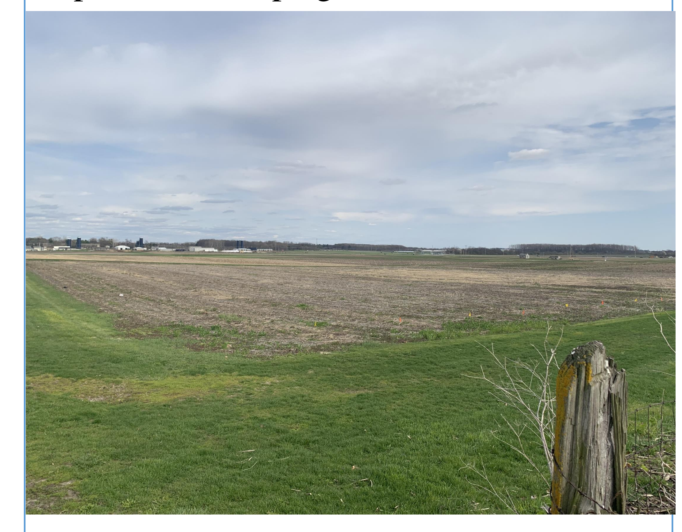
View of the research farm at UIUC.

Our research question was to focus on how the research farm at the University of Illinois at Urbana-Champaign (UIUC) and the iconic bar KAMS on the UIUC campus town contribute to the culture of Champaign-Urbana as a whole. Being a community that represents many different cultures from many different backgrounds—we wanted to focus on these locations, which we feel best represent Champaign-Urbana.