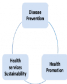
Fig 1: Context of health literacy.