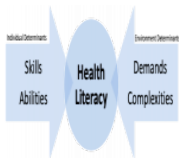
Fig 2: Determinants of Health Literacy defined by the WHO (2013) [12].