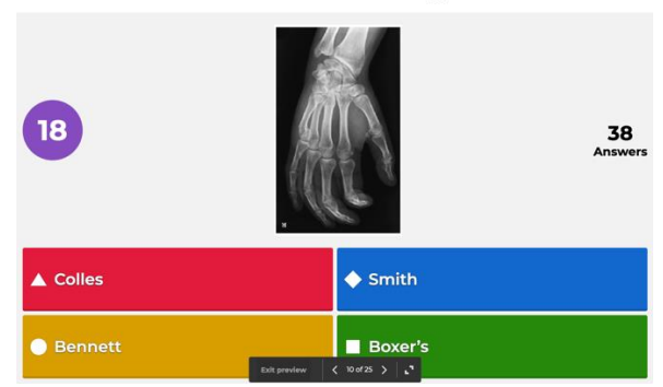
Fig. 2. Multiple choice question generated and made available to MIR students within the Kahoot environment, in the subject of methods and techniques in medical imaging.