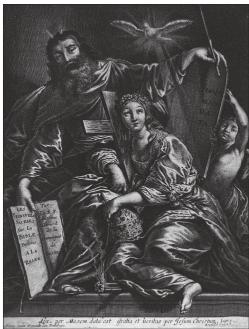
Figure 6 Girard, Les peintures sacrées sur la Bible dédiées à la Reyne , Paris: Antoine Sommaville, 1656, BMdL SJ E781/13 (frontispiece)

ment the narrative, which aligns popular architectural compositions present in frontispieces in the seventeenth century. 62 In this case, the upper strip comprises three small panels and discusses the main theme symbolically; while the lower strip is just one panel and it is the most challenging to relate to the engraving's main message—sometimes, it is linked directly to the lemma. 63 These findings have been made more challenging by two existing copies held at BSW (O.128.44) and BPG (XXo B.o. 1871), where I discovered two engravings which had never been listed in bibliographies and catalogs (Figs 8–9). The two newly identified engravings are placed before the engraving the Drelowanie wtóre (“Hammering Two”) (BSW, BPG, cf. Fig. 8) and the engraving Drelowanie trzecie (“Hammering Three”) (BSW, cf. Fig. 9). 64