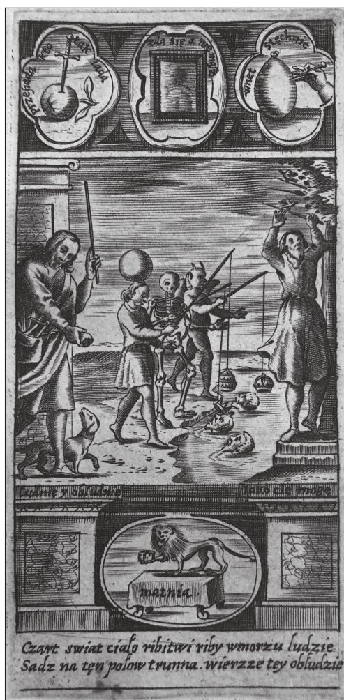
Figure 9 [Mirowski,] Młotek duchowny w sercach ludzki drelujący... , Gdańsk: David Friedrich Rhete, 1656, BSW, O.128.44, f. between H 1 v-H 2 r

since the text corresponds to the image composition. This makes one reconsider whether it is justified to speak of an emblematic series, because, as can be seen from this example, one cannot be sure that the publisher did not paste in additional engravings. It might be the case that they have not survived to our times because someone tore them out, e.g., for devotional reasons (people often used to cut out engravings and paste them in their notebooks) 81 or collector's reasons (this was a particularly popular trend in the nineteenth century). 82 It is also possible that only some of the copies received additional engravings. The upper strip of the emblems refers to the scenes below it. The first cartouche shows making lace or rope using bobbins, with the inscription saying: "Gossip" ("Plotki"). Braiding, which was thought of as a women's pastime, apparently to Mirowski seemed the perfect situation for spreading rumors. While this relates to Kempis's warning that it is better to say nothing than to gossip, it also corresponds to Wisdom 11:17 and the figures below: the rumormonger can suffer from rumors much like the bee can be killed