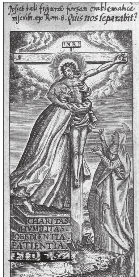
Figure 1 Kempis, De imitatione Christi libri quatuor , Douai 1608, NkČr BG X 38, f. 158 r

In the case of Polish translations, almost all of them were made by Jesuits (or their alumni) except the one that is the subject of this article— Młotek duchowny ( Spiritual Hammer ) printed in 1656. Neither the author of the oeuvre nor its translator were mentioned on the titlepage or in the colophon. It consists of prefatory matter, four chapters, and a template of the last will “translated from Italian.” 14 The composition repeats the “Catholic” arrangement of the content. In addition to the illustrated title page, each chapter is accompanied by a large engraving, and there are also small decorative graphical elements. 15