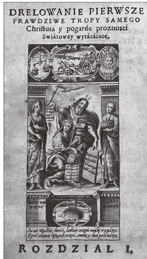
Figure 7 [Mirowski,] Młotek duchowny... , Gdańsk: David Friedrich Rhete, 1656, NZiO, XVII-4488-II, f. A 5 r