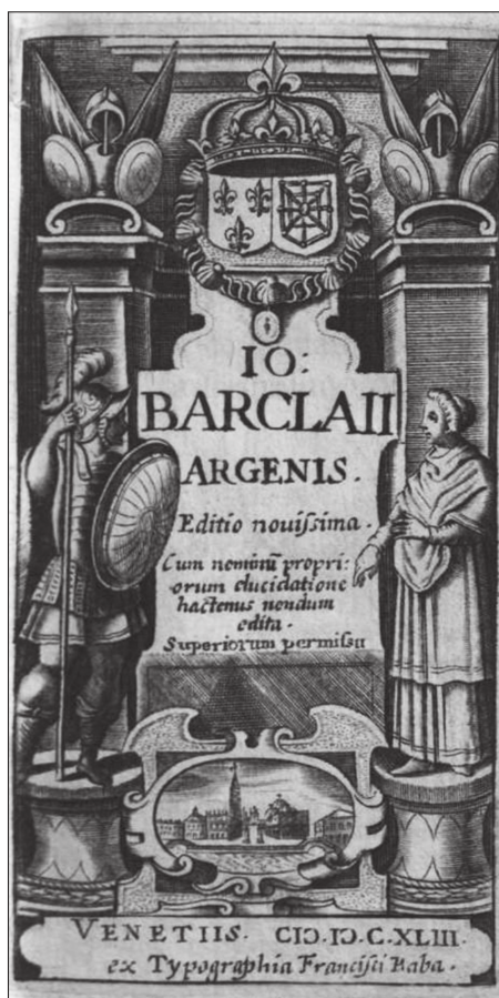
Figure 5 Barclayus, Argenis . Editio novissima cum nominum propriorum elucidatione hactenus , Venetia: Francisco Baba, 1643, ON 224.465-A (frontispiece)

The same compositional scheme recurs in each of the four emblems in most copies of the Młotek duchowny . 61 Each of the emblems' icons is divided into seven panels: the central strip constitutes the main scene and contains a narrative part, with two figures on either side to supple-