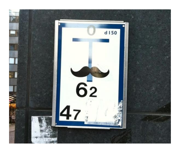
Figure 12 - a sign in Helsinki, Finland

While I had one meeting scheduled with a researcher at the University of Helsinki, I was otherwise by myself on the trip. I had to order my own food, check out at the market, and occasionally ask for directions in a region where the official languages are Finnish and Swedish. Luckily for me, many people in Finland also speak English and were happy to talk with me to practice the language with a native English speaker. On the train to the airport, I spoke for some time with a man who was born in Finland. He helped me with my Finnish pronunciation of Helsinki's roadways from the map I had in my pocket. He spoke Finnish, Swedish, Russian, English, and Hebrew, highlighting for me another cultural difference in the value of being multilingual. My understanding of the signs in these places was largely dependent upon my singular interpretation and internet searches. In France, I stayed with a friend who lived in Paris and spent the majority of my time with her. She met me at the train station and gave me a guided tour for the week. She knows the roads and the language. I met some of her friends and I stayed in her neighbor's apartment. She explained signs to me while we were out in the city. Though I had less need to attend to signage in Paris, I learned more about the history and implications of signage throughout the city through conversation with my friend. My experience and degree of understanding of the signs around me largely depended upon my social interactions.