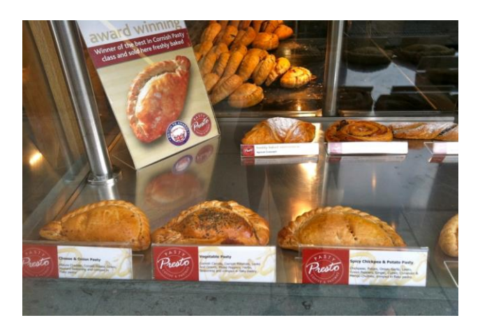
Figure 5 - the window of a pasty shop in Cambridge, England

Buying food in each of these new settings necessitated active mental engagement from me in order to weigh nutritional value and cost. In the markets where I shopped, I was required to scrutinize packaging and food labels for words and images in order to meet nutritional requirements. Shelf placement of products in markets helped me understand what might be inside the food packages I bought. Dairy products were in a refrigerated section, tea and coffee were situated in an aisle together. Though the items in the produce section were a bit easier to distinguish, I had to think of price in pounds or euros per kilograms, two systems of measurement not local thoughts. At restaurants or food carts, I used other-thantext signs to determine what I would have. For example, Figure 5 shows one example of a meal I ate in Cambridge, England. The term 'pasty' was new to me, but having the food displayed in the window along with signage describing fillings and prices, I was able to gain a sense of what the food might taste like and what kind of nutritional value it may have.