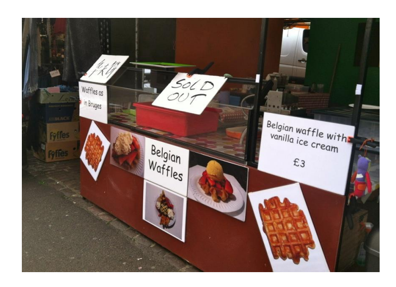
Figure 2 - one of my favorite places for a treat in Cambridge, England

with whom I may or may not have shared a spoken language. In order to make decisions about my meals, I had to actively engage with the signs and people around me, weighing nutritional value, taste, and budget criteria (See Figure 2).