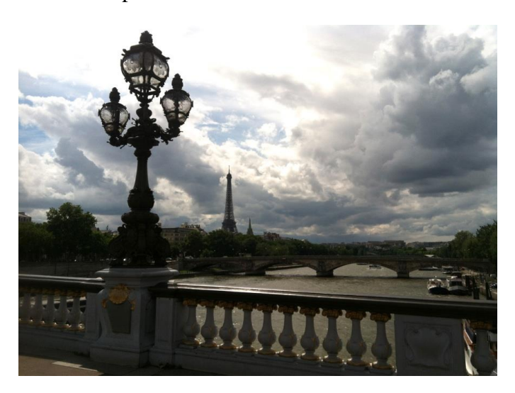
Figure 4 - a lamppost on a bridge in Paris, France