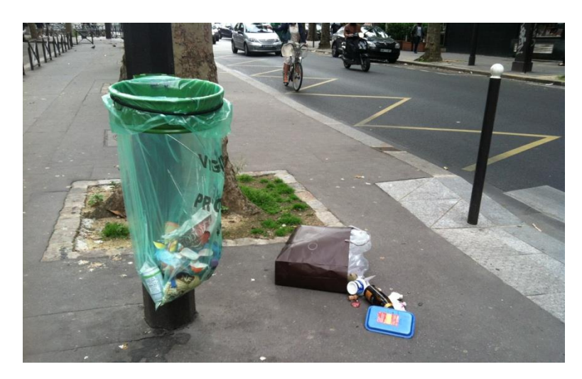
Figure 8 - a garbage bag in Paris, France

large metal ring attached to a pole (see Figure 8). I wondered if this was one possible solution to London's problem.