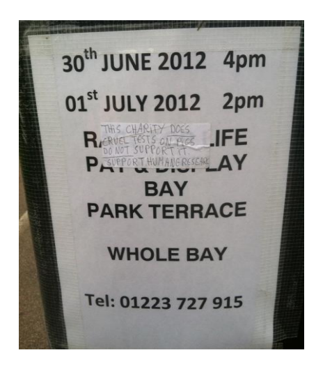
Figure 10 - a sign near Parker's Piece, Cambridge, England

In my casual look at the symbolic functions of signs, I found some obvious examples of signs with secondary authorship. I photographed signs in England, Finland, and France that visibly had more than one layer of authorship; signs that left questions in my mind about which author or voice is more visible. In Cambridge, near the community green space close to where I stayed, I found a sign advertising a charity fundraiser. On the sign, there was a sticker stating, "This charity does cruel tests on pigs. Do not support it. Support humane research." (see Figure 10). Though I understood the issue on a surface level, I did not have access to the background of the charity or the opposing party who added the second layer of authorship.