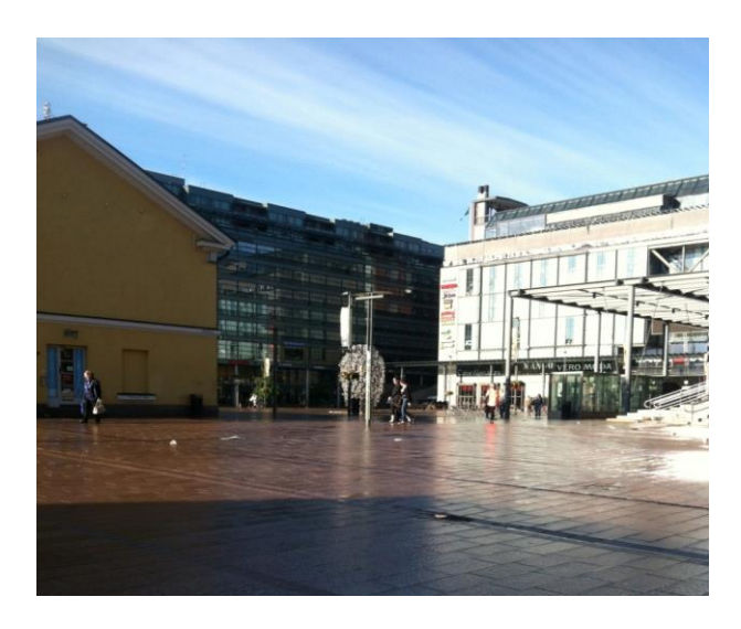
Figure 9 - a washed walkway outside of a shopping mall in Helsinki, Finland

In Finland, I saw workers pick up trash with brooms and street sweepers. After the debris was gone, a machine washed the pavement. I took a photograph of the walkway just after the machine had cleared the area (Figure 9).