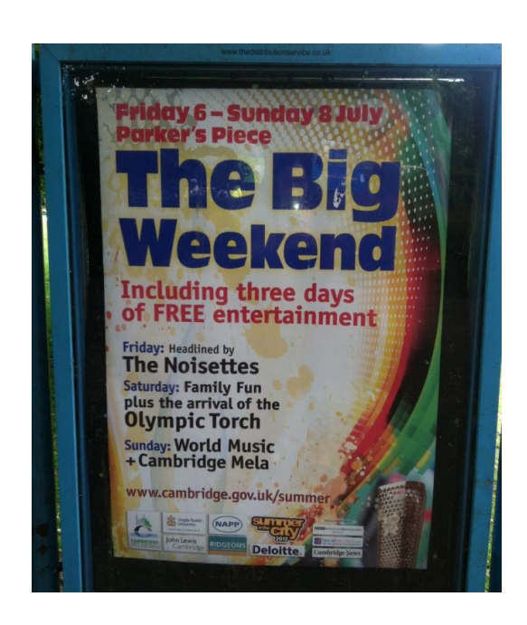
Figure 7 - a advertisements for 'The Big Weekend' in Cambridge, England

When choosing an activity, I generally looked for my plans to be inexpensive and interesting to me. Though I had guidebooks for all of my destinations, I relied often on found advertisements for shows, events, and museums to guide my decisions for planned leisure activities. In Cambridge, I saw posters all over town for the 'Big Weekend'. As it was free and within three minutes walking distance from my residence, I attended.