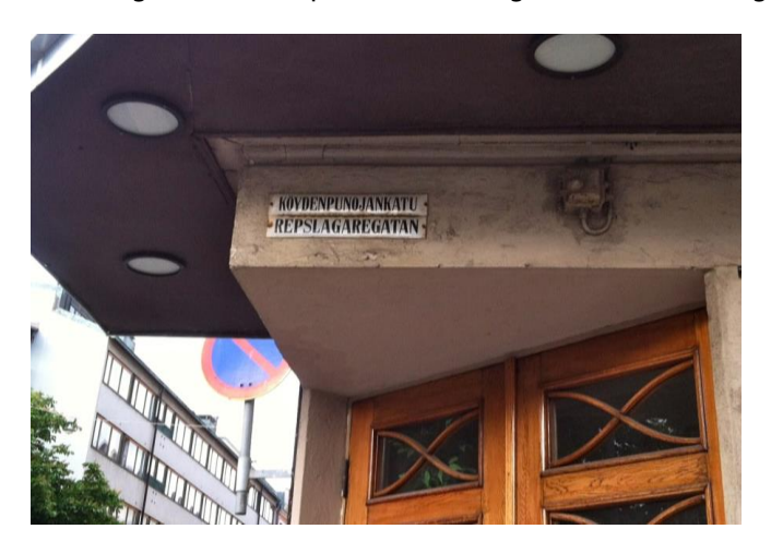
Figure 3 - a street sign in Helsinki, Finland

Through my activities in each of these cities, from sightseeing to visiting cultural events, I gained an appreciation for the sense of place in each territory. I wanted to be able to answer the question, "What is it like there?" when I talked to my friends and family about the trip. I balanced my activity choices with interest and cost. Often, my activities consisted of a self-guided walking tour. Along the way, I photographed signs and sights which helped me to develop a sense of each place I visited. In my analysis, I focused on these ideas with Lou's concept of language as resource and capital in mind. In this way, the distinct architecture of broadly defined signs (i.e. buildings, public art, traffic patterns, in addition to road signs and advertisements) in each area contributed to my development of sense of place. For example, in Paris, while out walking, I developed a sense that this city values detail and intricacies. I photographed a lamppost on a bridge (see Figure 4). Decorative features like these are not uncommon in Paris. I saw these 'everyday' works of art as cultural resource and capital in this linguistic landscape that communicated a sense of place.