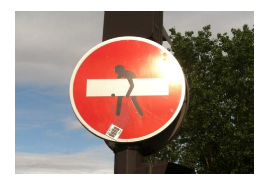
Figure 11 - a sign near Notre Dame in Paris, France

In Paris, I considered the meaning and authorship of a particular sign for an extended time (See Figure 11). Initially, I could not determine if there was a second layer of authorship or not, as the sign appeared cohesive. But, through conversation with a friend who lived in Paris, I learned a red circle with a horizontal white bar indicated drivers should not enter the roadway from that direction. With the addition of the stick figure who appears to be carrying the horizontal white rectangle, we could only guess at the meaning of the second layer of authorship, but nevertheless found the sign amusing.