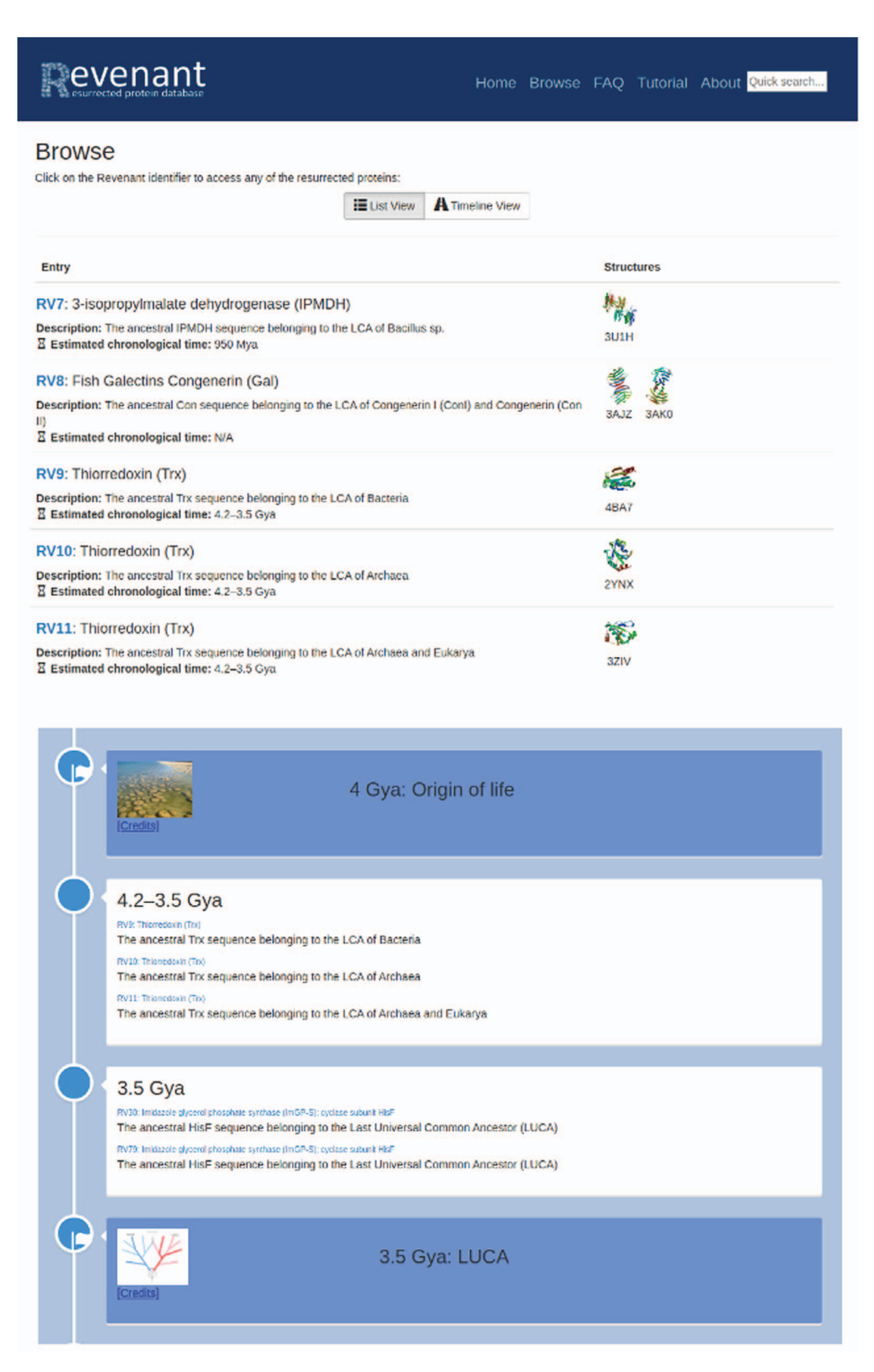
Figure 2. Two different browsing capabilities are available in Revenant. In the first one (top panel) proteins are listed sequentially using their RV codes. In the second browser (bottom panel) we display the Revenant proteins in an Earth's timeline showing important biological events since the origin of life.