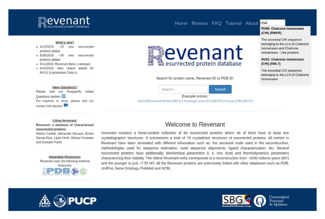
Figure 3. Screenshot of Revenant web server showing the home page and search utilities.

dim-vision in vertebrates. In a similar way, the used of ASR and resurrection techniques has had a key role to address different biological questions, such as specificity and biological activity (18), stability (19), promiscuity (20), study of alternative evolutionary histories (21), epistasis (22), evolutionary analysis of visual pigments (23), rational engineering (24) and emergence of new active sites (25), influence of evolutionary trajectories (26) and effect of duplication in functional divergence (27) just to mention a few of a large list of examples. Interestingly, as phylogenies could be calibrated with fossil records, resurrected proteins could recreate most probable states of proteins spanning very different geological times. The most challenging resurrections are about the very beginning of life on Earth (~4000 millions of years (28)).