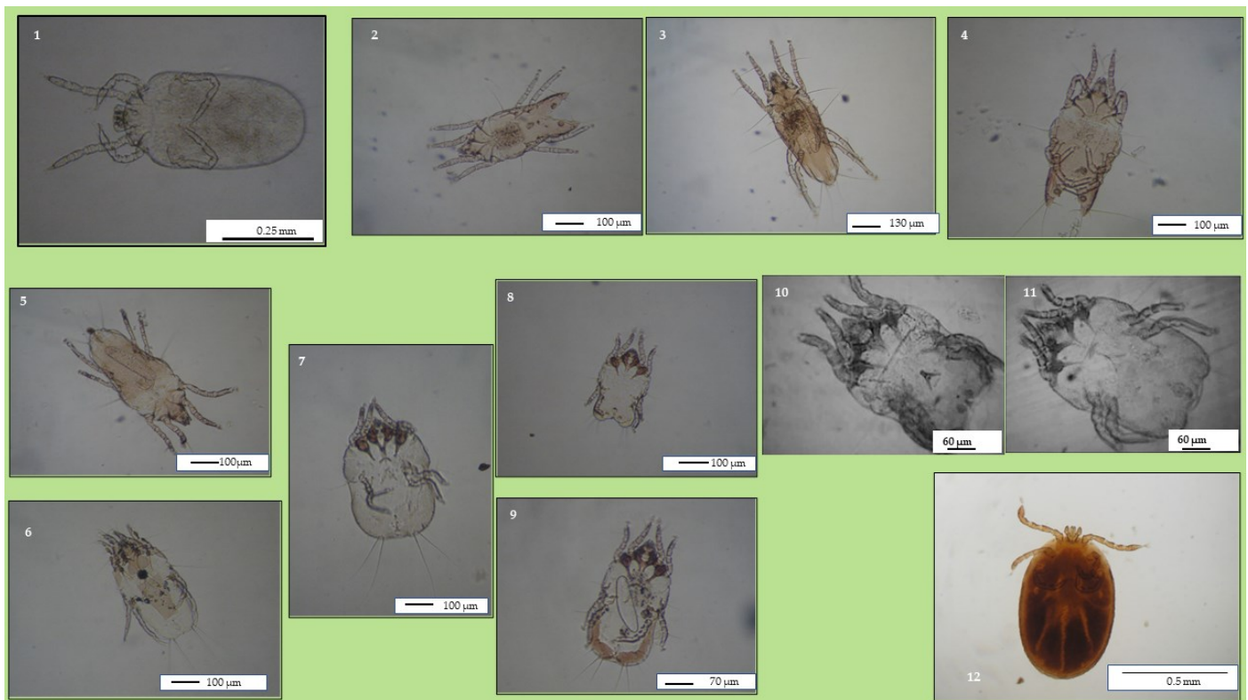
Figure 2. Mite (1–11) and tick (12) species identified in raptors in Tuscany, central Italy. 1. Neotrombicula autumnnalis larva; 2. Hieracolichus sp. male; 3. Hieracolichus sp. female; 4. Hieracolichus nisi male; 5. H. nisi female; 6. Glaucalges attenuatus female; 7. Kramerella lunulata female; 8. Kramerella lyra male; 9. K. lyra female; 10. Kramerella sp. male; 11. Kramerella sp. female; 12. Haemaphysalis sp. larva.

In some birds, more arthropod species were concurrently identified. Among diurnal raptors, two different chewing lice species, namely D. rufa and L. tinnunculi , and larvae of the tick Haemaphysalis sp. (Table 1; Figure 1(2,3); Figure 2(12)), were identified in a kestrel ( F. tinnunculus ). Another kestrel ( F. tinnunculus ) was instead found to be concurrently positive for D. rufa and N. lucidum (Table 1; Figure 1(2,6)). The two honey buzzards ( P. apivorus ) were found to be positive for both chewing lice and mites; more specifically N. clayae or C. apivorus (Table 1; Figure 1: 5, 7) and H. nisi (Table 1; Figure 2(4,5)) were concurrently found in these two honey buzzards.