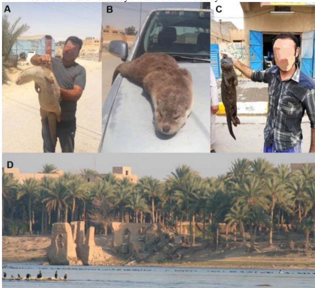
Figure 2. A and B: adult male Eurasian Otter in Anah; C: adult female Eurasian Otter in Rawa; D: the landscape of the Euphrates River banks in Anbar Province in western Iraq.

referred them as to “Qundis” (Eurasian Beaver: Castor fiber , Rodentia). This misidentification did not come as a surprise, as the local fishermen are not used to see Eurasian otters in the streams and waterways of the Euphrates River in western Iraq, where they appear to be extremely rare. However, after a close morphological examination of the dead animals, with a special focus on their cranial parts, they were confirmed to be Eurasian otters by the authors of this study.