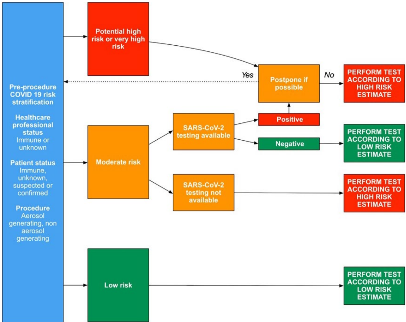
FIGURE 1 Flowchart for planning procedures, taking into account urgency of the procedure and the assessment of the patient's risk of infection and the allocated procedure

Throughout the COVID-19 pandemic, there is a general advise to question patients already in the planning phase, before their arrival