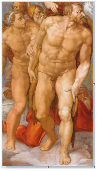
Figure 4: Michelangelo Buonarroti. The Last Judgment. The external jugular vein is evident on the neck of John the Baptist (Public domain, via Wikimedia Commons).

seems to show a slight line resembling the external jugular vein on the right side of the neck.