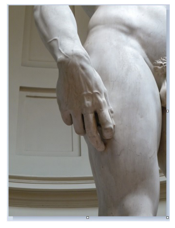
Figure 2: Michelangelo Buonarroti. David. Detail of the right hand showing a network of turgid superficial veins and the initial tract of the basilic vein (Jörg Bittner Unna, CC BY 3.0 <a href="https://creativecommons.org/licenses/by/3.0">https://creativecommons.org/licenses/by/3.0</a>, via Wikimedia Commons).

Interestingly, the right side of the David's neck shows a distension of the external jugular vein on the sterno-cleido-mastoid muscle until the clavicle (Figure 3). This superficial vein is not normally evident at rest, whereas it is particularly turgid during physical efforts, for example when singing, blowing or screaming. In a recent paper Gelfman [24] hypothesized this finding as a pathologic sign of elevated intracardiac pressure and possible heart dysfunction. However, he also interpreted this venous distension as the consequence of muscular tension before the combat. Indeed, David also appears markedly frowning with tense muscles. Anyway, since David's head is turned left, the taut skin flattens the right external jugular vein against the sterno-cleido-mastoid muscle. Then, this vein does not appear so turgid or tortuous.