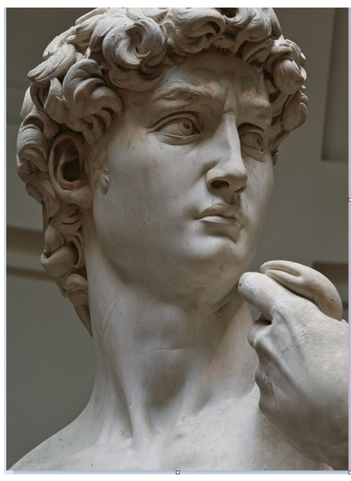
Figure 3: Michelangelo Buonarroti. David. Detail of the neck with an evident external jugular vein.