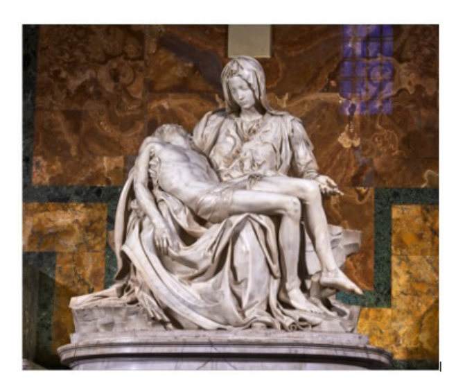
Figure 1: Michelangelo Buonarroti. Pietà (Juan M Romero - Opera propria, CC BY-SA 4.0, https://commons.wikimedia.org/w/index.php?curid=46153417).

Surprisingly, Michelangelo did not represent turgid veins in the David's lower limbs, apart from a very short venous tract on the medial margin of the partially lifted left foot. Saphenous veins are not evident.