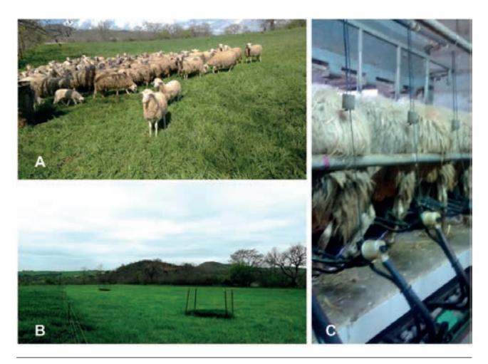
Figure 1. A) One of the two investigated ewe groups; B) the pasture plots; and C) daily milking.

Both groups were supplemented with: 420 g DM ewe<sup>-1</sup> d<sup>-1</sup> of concentrate split into two meals at milking, 130 g DM ewe<sup>-1</sup> d<sup>-1</sup> of fava bean seeds, 130 g DM ewe<sup>-1</sup> d<sup>-1</sup> of corn seeds, 30 g DM ewe<sup>-1</sup> d<sup>-1</sup> of extruded linseed, 30 g DM ewe<sup>-1</sup> d<sup>-1</sup> of soybean oil, 200 g DM ewe<sup>-1</sup> d<sup>-1</sup> of sugar beet pulp before grazing, 300 g DM ewe<sup>-1</sup> d<sup>-1</sup> of wheat straw after grazing and 440 g DM ewe<sup>-1</sup> d<sup>-1</sup> of a alfalfa hay overnight. Animals had continuous access to water. When animal groups were not on pasture, they were kept in two separate enclosures or, indoors, in two separate parts of the stable. Every day, the farmer and a member of the research staff verified the usage level of supplementation dose and the lack of orts.