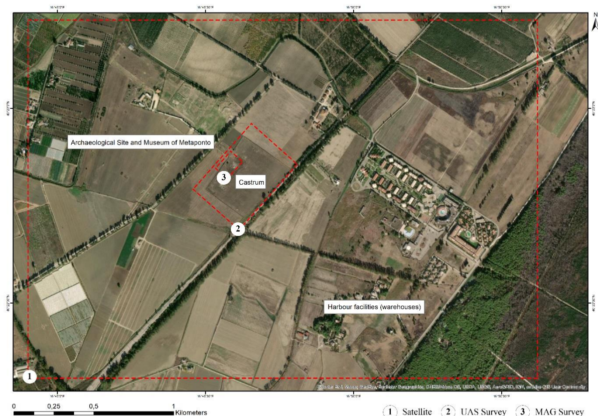
Figure 1. Survey area with reference to the extent of the survey for each tool used.

The analyses carried out in the Metaponto area involved several remote sensing and Earth Observation (EO) technologies: (i) medium- and high-resolution multispectral optical sensors; (ii) zoom-in and validation on areas of in-depth study with RGB, multispectral, and thermal UAS (Unmanned Aerial System) and (iii) geophysics, including geomagnetometry; and (iv) historical aerial photos. These data were combined with those collected by archaeologists (Figure 1).