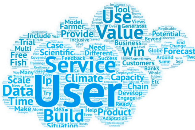
Fig. 4. Interactive session: Word Cloud.