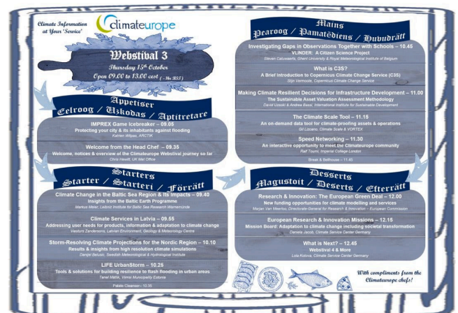
Fig. 6. The program of the third Webstival with different translations in English, Swedish, Latvian, and Estonian. produced by Rebecca Parfitt.

Feedback on both Festivals was actively collected from participants during the Festivals itself. At the first Festival, a so-called wish tree was created, and the participants were invited to write their wishes for the future events of Climateurope. In addition, at the end of the first Festival, there was an open forum discussion inviting feedback from the audience which helped to form future events. Furthermore, key participants and speakers of the first Festival were identified for more in-depth interviews to provide targeted feedback which was also used to form the basis of recommendations for future events.