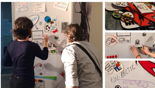
Fig. 5. Interactive poster at the second Climateurope Festival in Belgrade, © Natalie Garrett.

material, surrounded by magnetic cartoons (created using the scribed cartoons from the first Festival) and an array of colored white board marker pens. Some delegates used the opportunity to promote their projects either by affixing their project fliers (e.g. Climate Fit City and IMPREX) or by writing their project names next to a cartoon of an eye (e.g. Edu-Arctic, CRESCENDO and Scientix) which was intended to encourage people to ‘look into’ these projects for themselves. Other delegates shared ideas and quotes, including: “what happens in the Arctic doesn’t stay in the Arctic,” a message which refers to melting ice and its impacts, such as rising sea level. Another message “engage the other half,” referred to the importance of including climate sceptics in discussions/engagement relating to climate change.