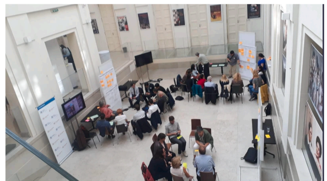
Fig. 3. Interactive session: Climate Services at work, © Super Travel.

To provoke some interesting engagement, an interactive poster was designed (Fig. 5). The poster was made from magnetic whiteboard