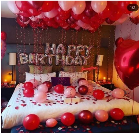
Figure 6. Luxury in the form of implementation

As mentioned before, Veblen considered basis of people's dignity to portrayal of wealth to conspicuous consumption and leisure. Z. A. and M. Sh. are so mentioned the types of luxury gifts and their conspicuous nature in pseudo-events of micro- celebrities.