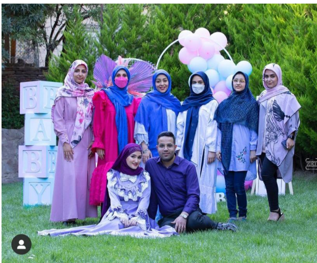
Figure 2. The present participants