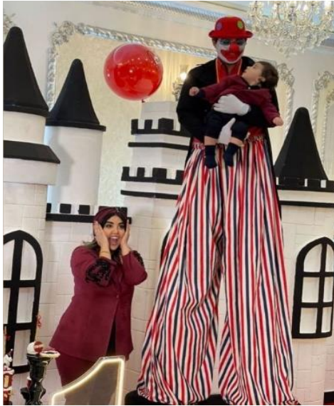
Figure 5. Form of implementation, staged