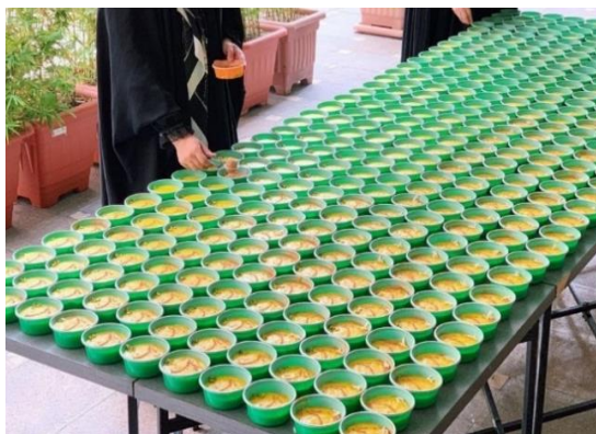
Figure 8. Planned humanitarian actions

M. S. stated regarding micro-celebrities' humanitarian activities: "we cooked sholezard (an Iranian traditional desert). I think there were at least 1000 bowls of sholezard. It was supposed to start pouring and distributing them from 12 o'clock. N. D. said – let's gather 500 bowls and arrange them beautifully so that I can take a good photo. We insisted that people were waiting, and the desert would cool down; however, it was useless. Our work was delayed for almost two hours as she took images from various angles for her stories and posts."