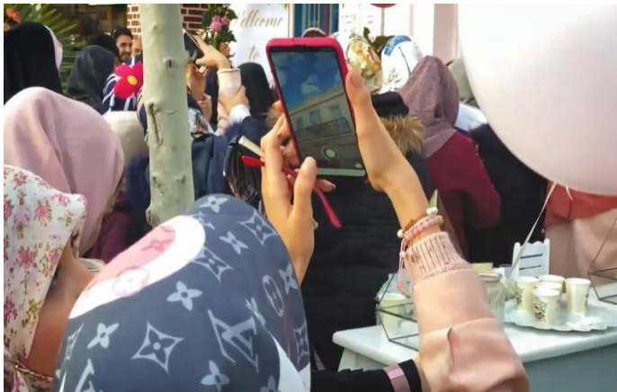
Figure 3. Practical rules 1

“the other time that I had been invited to their birthday party everybody was holding a cell phone, and no one put them down. The poor child whose birthday was being celebrated did not understand anything at all from noise. Honestly, even adults like me were bored among all those influencers as everybody was sharing stories.”