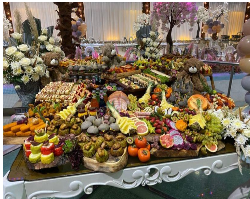
Figure 7. Luxury in the form of presentation, the types of refreshments

"In general, the gifts were very luxurious and expensive, particularly the gifts that an influencer give to other influencers. That is because they know the images will be shared via stores. Thus, at least the box, its size, particularly the price of the gift is very important."