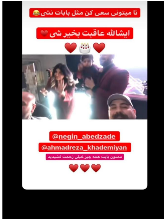
Figure 4. Practical events

collared interpretations of how their maker or makers perceived and reconstructed the reality (Serafinelli, 2018: 41).