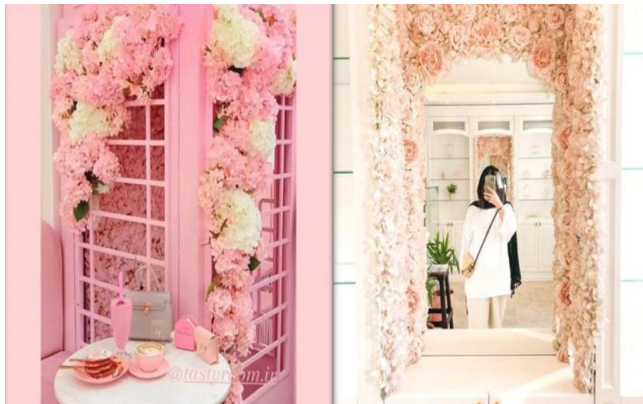
Figure 9. Location 2

As Sarah Frier, reporter of Bloomberg, said in "No filter: the inside story of Instagram": "after the graphic revolution and the emergence of Instagram, many businesses and various environments changed the manner of designing spaces and marketing their products to adjust them to the requirements of establishing visual relationships and making them fit to be displayed on Instagram (Frier, 2020).