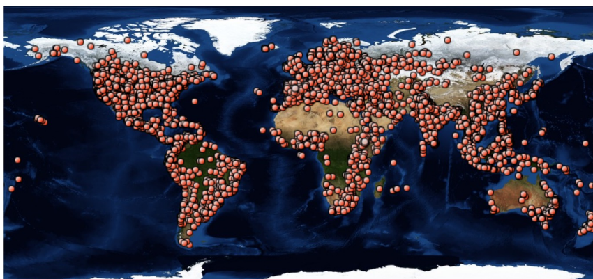
Figure 1. Origin of visitors

Now, if we analyze JOTSE's internationalization with the number of visited of JOTSE's website (410,814 visits between November 4th, 2015 to January 20th, 2022), we can observe in the figure 2 the distribution in the world with Philippines, US, Indonesia and Spain in the first positions.