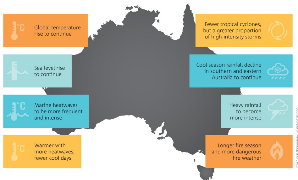
FIGURE 3: OVERVIEW OF FUTURE CLIMATE PROJECTIONS FOR AUSTRALIA IN THE STATE OF THE CLIMATE 2030 REPORT (CSIRO AND BOM, 2020. USED WITH PERMISSION).

It is important to recognise that not all regions of Australia are projected to experience increased risk of natural hazards due to climate change. For example, while some areas may experience increased frequency of cyclones, others may experience decreased frequency (Earth Systems & Climate Change Hub, 2020).