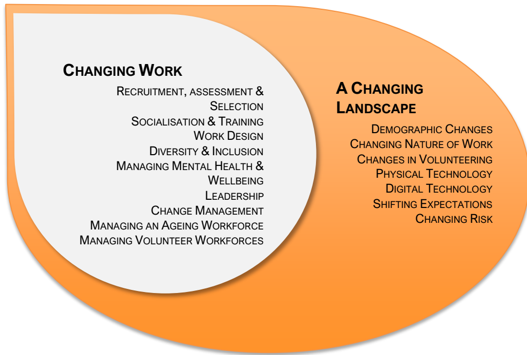
FIGURE 1: WORKFORCE 2030 THEMES