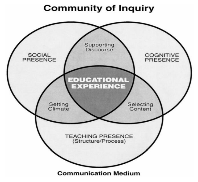
Figure 1 Community of Inquiry Framework (Garrison et al., 1999, p. 88)

Cognitive presence refers to how the instructor takes into consideration students' preparedness to participate in online learning experiences. It refers to the extent to which learners can construct meaning through sustained reflection and discourse (Garrison, et al., 1999) and is primarily connected to the learning context. In practice, online cognitive presence may be manifested in web conferences, structured and unstructured forms of participation, and practical videos of authentic classroom situations that facilitate high levels of reflection (Carrillo & Flores, 2000).