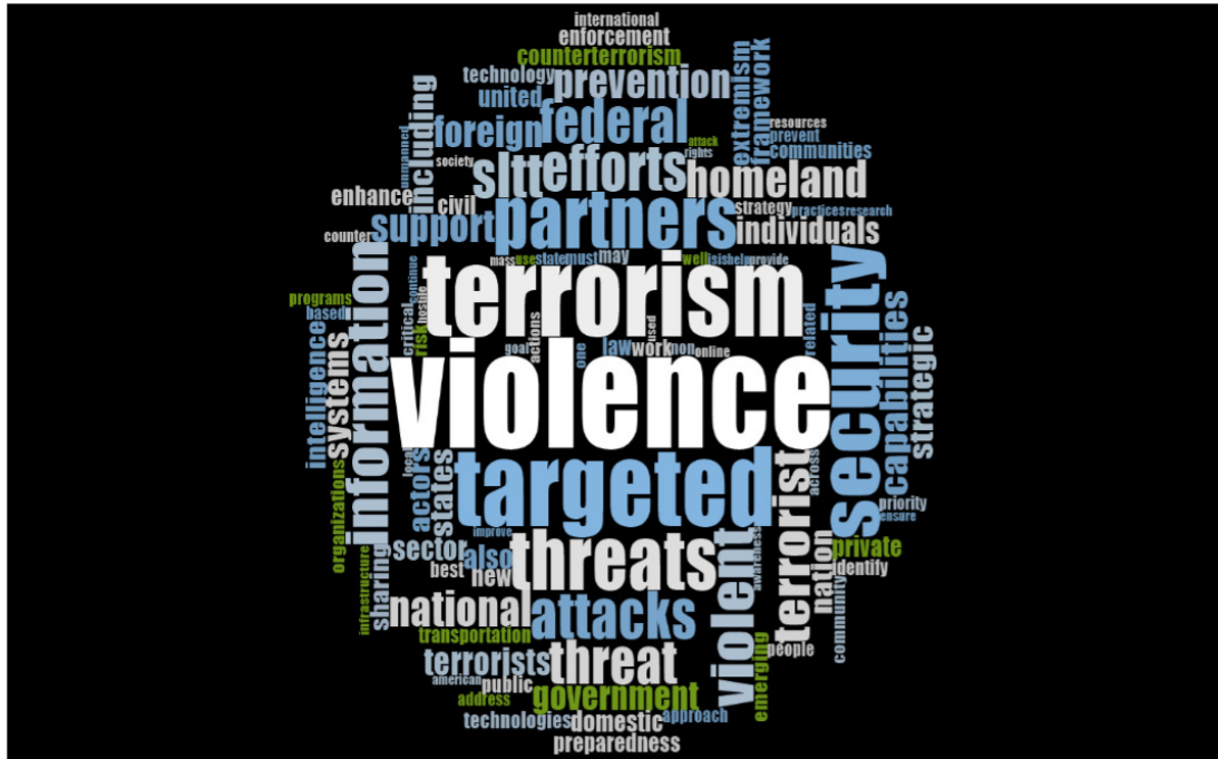
Figure 1. Word Cloud U.S. CT/CVE Policy

The 2019 DHS Strategic Security Framework for Countering Terrorism and Targeted Violence 13 states that “the U.S is facing an increasingly complex, and evolving threat of terrorism and targeted violence from within its borders by means of non-state actors, critical to the U.S economy and democratic governance.” Foreign terrorist organizations remain a major threat to domestic security, whether through directed attacks or by inspiring susceptible individuals within our borders to commit acts of terror.