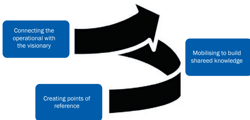
Figure 2: Steps in the iterative process

STINT's document on responsible internationalisation provides guidance to Swedish HEIs by identifying several aspects in which greater accountability is necessary. The document refers to the broader range of interests and challenges that an internationally active HEI must consider at present and in future. This report has highlighted different experiences of addressing such issues and indicated possible focus areas for HEIs, depending on their current situations. Below we suggest an organisational model for systematic responsible internationalisation that aims to develop the capacity of staff and the organisation to recognise and handle the complexities of internationalisation. This iterative model suggests creating points of reference (concrete examples) that may form the basis of specific projects aimed at connecting organisational and strategic aspects. Experiences of such projects contribute to fostering preparedness and a forward-looking approach at all organisational levels (Figure 2).