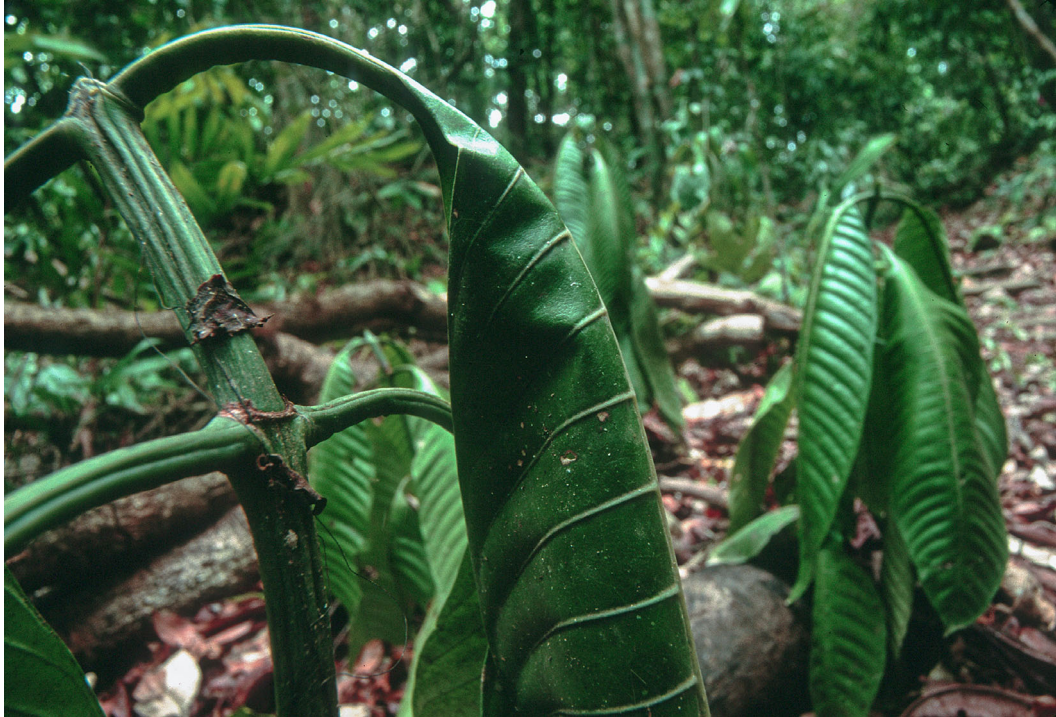
FIGURE 1 Wilting of tropical tree seedlings in the dry season. Barro Colorado Nature Monument, Panama.

more abundant in drier habitats showing lower \pi_{tlp} (Appendix S2: Figure S2A). A similar trend was seen for adult trees, but the relationship was only statistically significant for evergreen species (i.e., when deciduous species were excluded; Appendix S2: Figure S2B, Table S2).