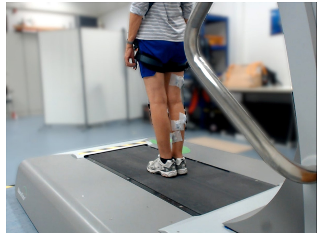
FIGURE 3 | The perspective of the camera.