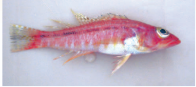
Chelidoperca investigatoris (Alcock, 1895)

During a routine visit to Puthiappa fish landing centre on 13-8-2010 while observing the trawl landings a few brightly coloured rare fish specimens were also observed along with the landings of threadfin breems and lizard fishes. The rare specimens were later identified as