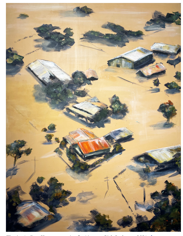
The Australian dilemma, praying for Lismore. Rick Cochrane, 2021. ◆

Floods are generally associated with increased incidence of vector-, food- and water-borne diseases due to increased abundance of mosquitoes, water and food contamination, and compromised hygiene and sanitation services. For example, gastrointestinal disease and leptospirosis cases were recorded after floods in England and Hawaii. River