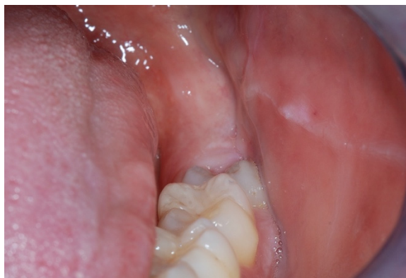
Figure 2. Severe linea alba of the cheek mucosae, which is a potential sign of prolonged bruxism activity in the form of bracing and/or clenching.

Concerning clinical examination, it should include an extraoral evaluation and an intraoral inspection to identify the signs and symptoms possibly related with bruxism [19,20]. The extraoral evaluation should assess the jaw muscles (e.g., evident muscle hypertrophy), the TMJ (e.g., presence of TMJ noises suggestive of disc displacement or joint degeneration), the presence of pain (e.g., jaw-muscle pain, TMJ pain, and headache), and functional symptoms (e.g., difficulty opening the mouth wide). The intraoral inspection should include a comprehensive dental examination (e.g., tooth wear, tooth enamel chipping, cracks and fractures of natural teeth, restoration failures, tooth mobility, and periodontal ligament widening on radiographic imaging) and an inspection of the mucosa of the cheek, lip, and tongue (e.g., linea alba, tongue scalloping, and traumatic lesions), as well as the presence of intraoral pain (e.g., teeth soreness and/or hypersensitivity) (Figure 2). As pointed out above, this approach is more oriented to identify the potential consequences of bruxism rather than the actual bruxism activity, and is unlikely to discriminate between AB and SB [39–41]. All clinical signs and symptoms should thus be assessed within the framework of a comprehensive differential diagnostic process.