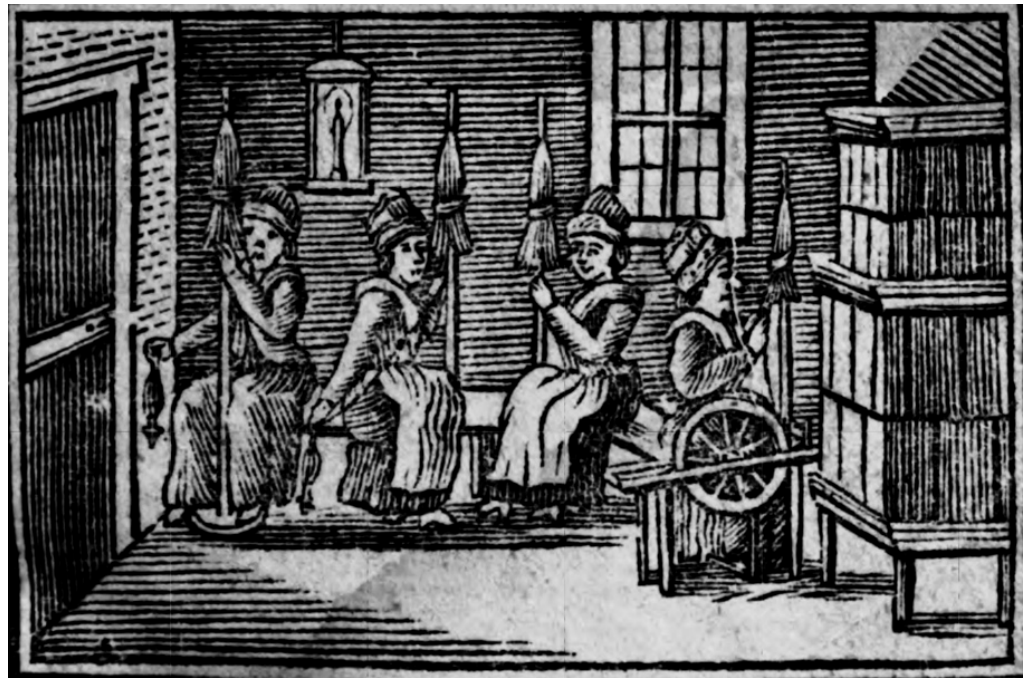
Figure 2. Title page of Ehrenfels's book Lessons for housemothers in their business ( Der Erdmuthes Hülfreichinn Unterricht für Hausmütter in ihren Geschäften ), published in 1807. The engraving depicts women making yarn from wool with a spinning wheel.