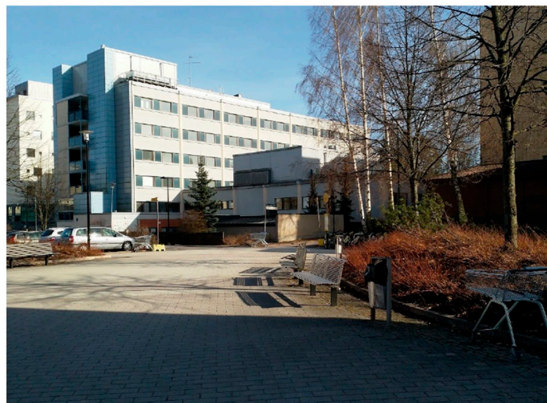
Figure 2. Student 22 draws attention to abandoned shopping carts, their number, and location. In the photograph, one shopping cart can be found on the right side and two more in the middle of the picture.