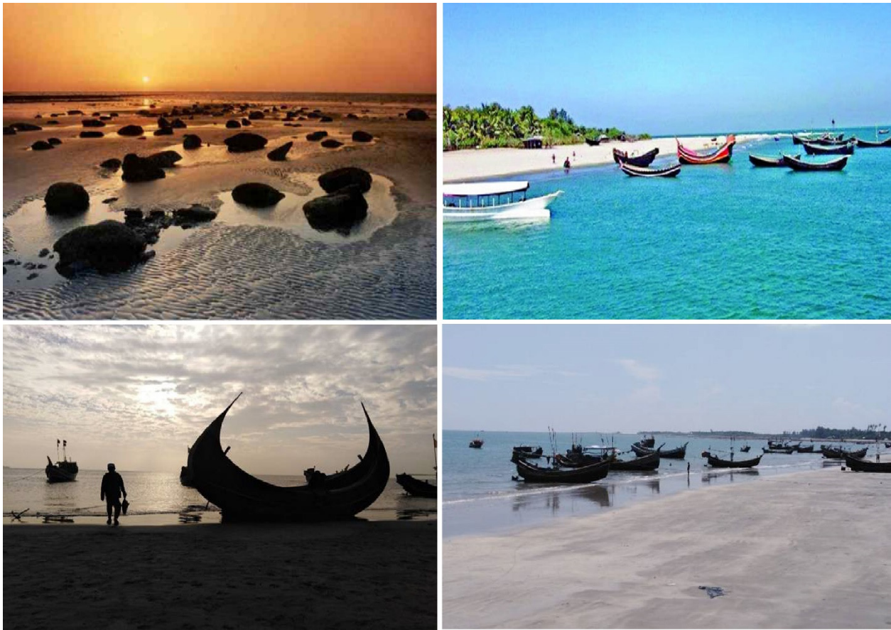
Figure 1. The scenic beauty of Saint Martin's Island.