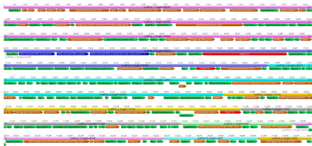
Figure 2. Gene organization of the nine scaffolds of the phage YerA41 genome. The scaffolds are organized based on size. The gene colors indicate predicted functions of their products: Green, hypothetical proteins; Blue, RNA polymerase subunits; Red, DNA polymerase-like proteins; Brown, phage particle associated (structural) proteins. The figure was generated using Geneious 10.2.6 ( www.geneious.com ).