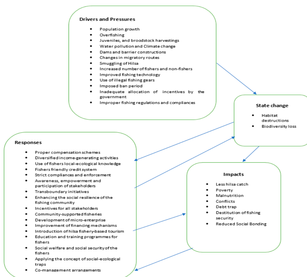
Figure 3. Proposal of the DPSIR framework for hilsa fishery management in Bangladesh.

The problems in an SES can be addressed at a social, economic or ecological level, as well as at a regulatory level through governance and management structures. This requires a societal response from the interested stakeholders of the SES as a means of the capabilities of society to respond to deteriorating situations and on the actions that are undertaken to solve or mitigate damage [53,54]. This is also true for the hilsa fishery, and to make a hilsa fishery SES sustainable, societal responses are necessary. As seen above, different responses were stated by the participants, also shown in the proposed DPSIR framework (Figure 3), including proper compensation schemes for the stakeholders, strict compliances, alternative income-generating activities, fisher-friendly credit systems, the use of fisher's local knowledge, the awareness and participation of stakeholders, and transboundary initiatives.