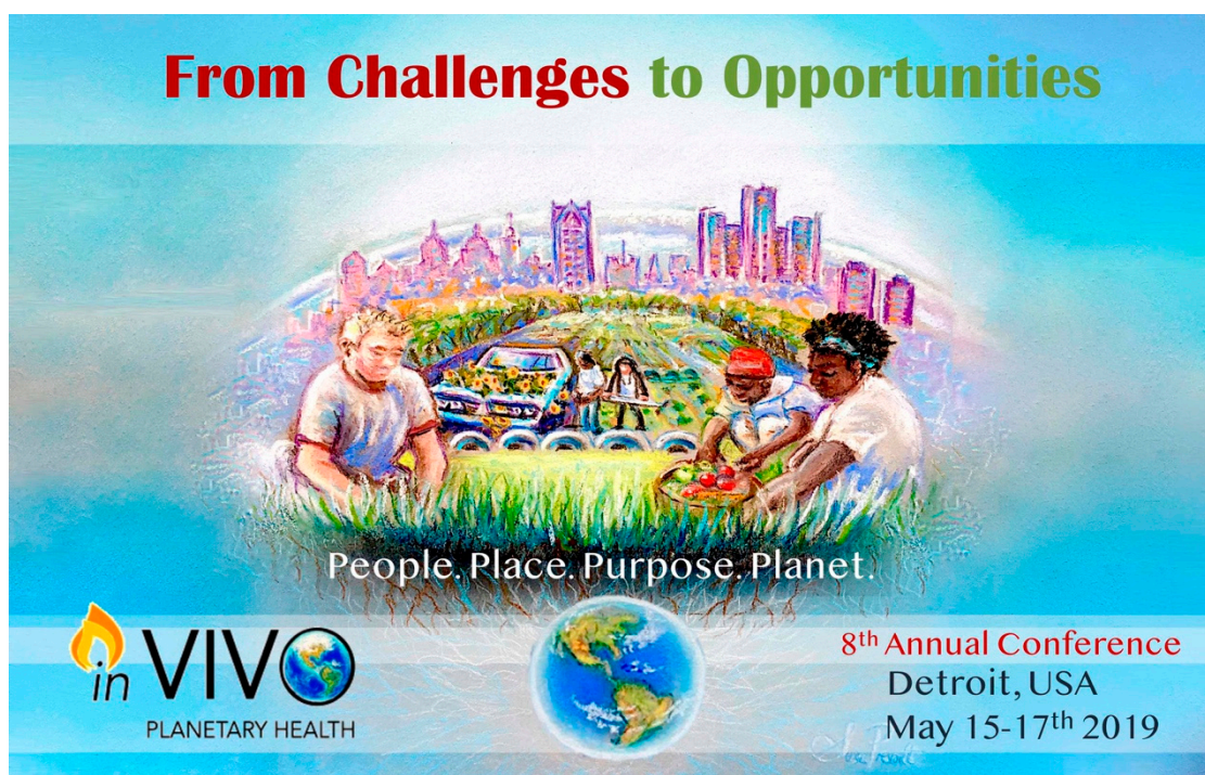
Figure 1. The theme of the 8th annual conference of inVIVO Planetary Health, held in Detroit, Michigan from 15–17 May, 2019 was “From Challenges, to Opportunities”.

The 8th annual conference of inVIVO Planetary Health (inVIVO), was held in Detroit, Michigan from 15 to 17 May, 2019. Our theme, “From Challenges, to Opportunities”, addressed the complex interdependent ecological challenges of advancing global urbanization and the impact on personal, environmental, economic, and societal health alike (Figure 1). Broadly, we discussed the multi-faceted dimensions of global ‘dysbiotic drift’ (life in distress) [1] on every level and explored strategies to overcome this.