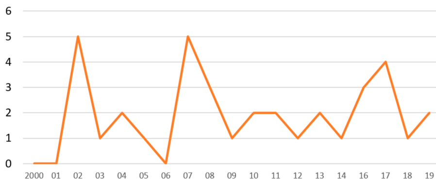
Figure 2. Amount of regulatory clinical trials of Phase III for drugs meant for short-term treatment of AHF and/or AdHF per year of publication in the period 2000–2019.