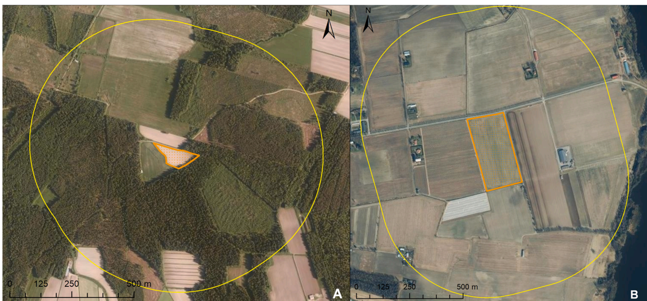
Fig. 1. Illustration of two landscapes differing in the amount of spruce branch biomass in a radius of 500 m from the edges of a carrot field inspected for the occurrence of Candidatus Liberibacter solanacearum . The landscape in A) had a high biomass of spruce branches while the landscape in B) had a low spruce tree biomass in the surroundings of the carrot field.

In the second analysis step, different proxies for spruce branch biomass were added to the model, as well as the biomass of spruce branches-by-carrot cultivation interaction, carrot cultivation years since 2006 and soil type (clay soils, coarse mineral soils, and organic soils). Carrot cultivation years since 2006 and biomass of spruce branches-by-carrot cultivation interaction were not included in the final model because their effects were not statistically significant. In addition, the number of carrot cultivation years since 2006 was correlated with carrot