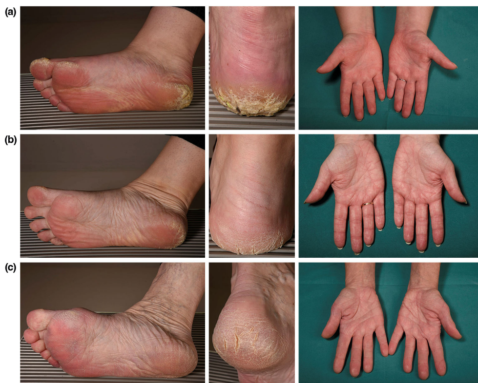
Figure 2 Dermatological findings in patients with DSP c.2493delA p.(Glu831Aspfs*33) mutation. Variable focal hyperkeratosis of the heels, toes and soles and palmar hyperlinearity (from mild to more prominent) in patients with DSP c.2493delA p.(Glu831Aspfs*33) mutation: (a) index IV:12, (b) III:7, and (c) IV:10.

dilated left ventricle in echocardiography (Table 2) without systolic dysfunction. III:1 had chronic heart failure according to medical records but could not be assessed, and the cause of heart failure remained unknown to us. Two patients (III:5, IV:8) had neither dilated left ventricle nor systolic dysfunction. In ECG, 3/8 had lateral T-inversions and one had lateral and inferior T-inversions. 4/8 underwent Holter monitoring and all had >100 VES/24 h, three had also episodes of non-sustained ventricular tachycardia (NSVT), and in addition two of them had >100 supraventricular extrasystoles (SVES)/24 h. None had severe ventricular arrhythmias (sustained ventricular tachycardia or ventricular fibrillation). 5/8 reported palpitations, but none reported chest pain or dyspnea. An implantable cardioverter-defibrillator (ICD) was implanted in 2/8.