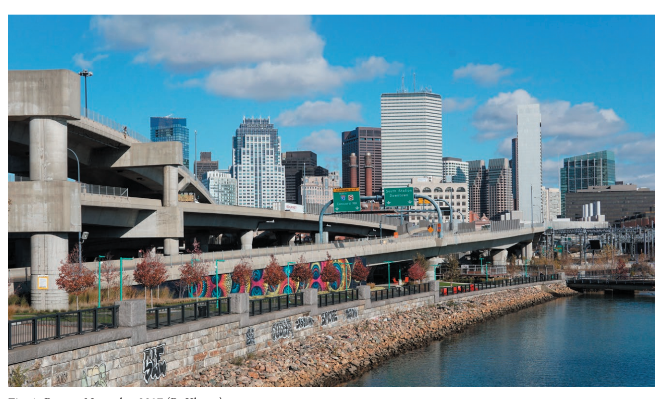
Fig. 1: Boston, November 2017 (R. Kletter).