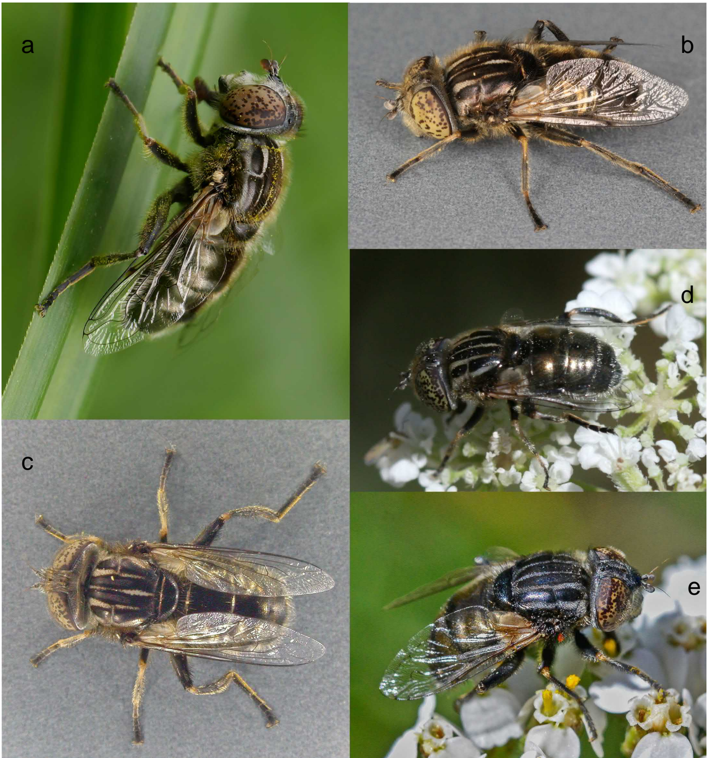
Figure 3. Females of Eristalinus sepulchralis. a) Parc de Woluwé, Brussels, Belgium, 2016-06-12, b-c) Wrexham, North Wales, U.K., 2009-08-08, d) Ebro delta, Catalunya, Spain, 2015-06-21, e) Hopeaki-venlahti, Kokkola, Finland, 2020-08-13