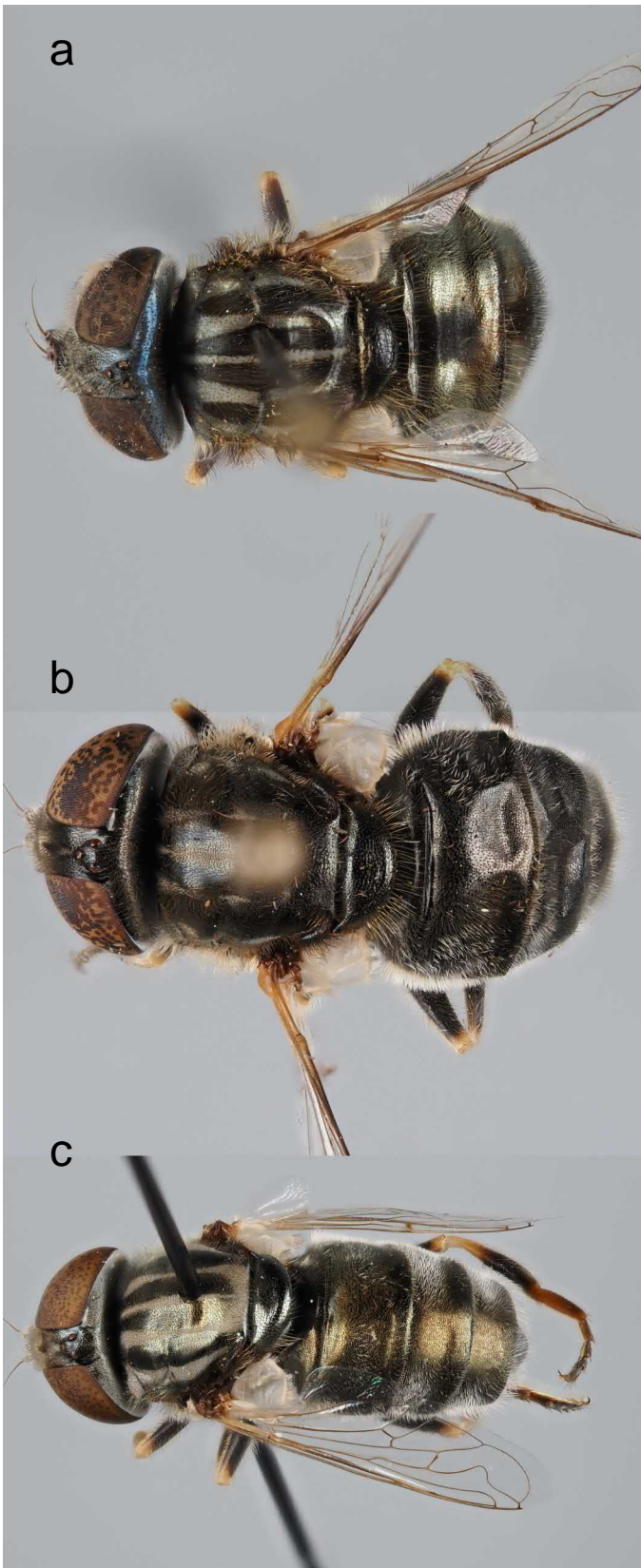
Figure 1. Females of Eristalinus . a) Eristalinus sepulchralis from Finland. Specimen http://id.luomus.fi/GV.87095 ; b) Eristalinus aeneus from Finland. Specimen http://id.luomus.fi/GV.50738 ; c) Eristalinus aeneus from Turkey. Specimen http://id.luomus.fi/GJ.1343 .